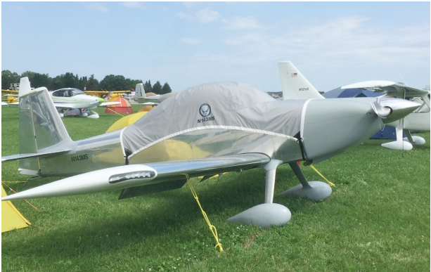
Van's Aircraft RV-8 Travel Cover, Light Weight Travel Canopy Cover