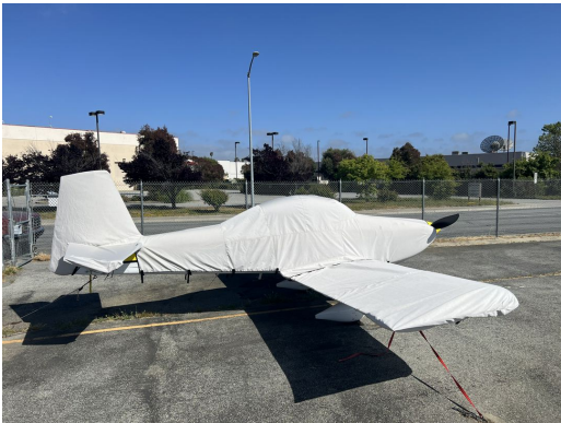
Van's RV-8A Complete Cover Set