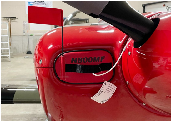
Van's RV-8 Engine Inlet Plugs

Engine Inlet Plugs are custom fit for your Van's Aircraft RV-8/8A intakes, made with heavy-duty vinyl material, and stuffed with a single block of sculpted urethane foam. Each plug has a zipper that allows the foam to be removed and dried if necessary. Engine plugs have warning flags that are visible from the cockpit or 'remove before flight' streamers sewn onto the face of the plugs. Most plugs are imprinted with the aircraft registration number in black for an extra charge. Storage bag NOT included. Engine plugs may be inserted after flight when the engine is still warm. Engine Inlet Plugs are commonly referred to as Cowl Plugs, Intake Plugs, Cowl Blocks, Engine Blocks, and Engine Bungs.