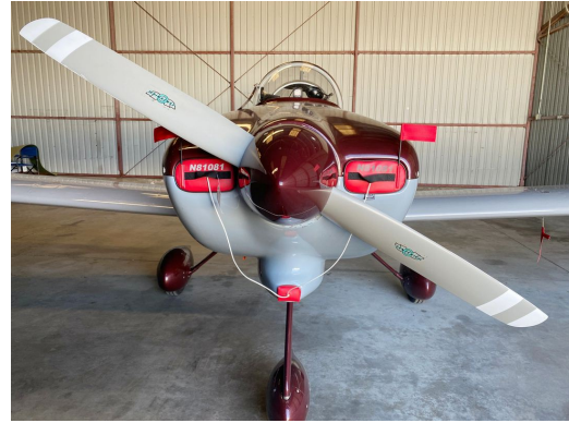
Van's RV-8A Engine Inlet Plugs