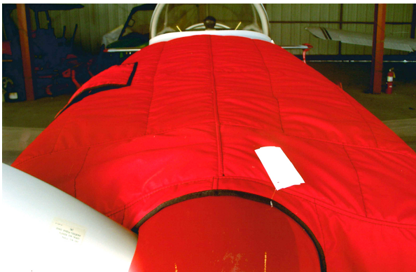
Van's RV-8/8A Insulated Engine Cover (From the Spinner Looking Aft))

This cover type is made from Silver Acrylic Sunbrella canvas and is 100% lined with a soft and smooth microfiber. Bruce's Custom Covers developed this material combination especially for aircraft protection. The outer material is medium weight and treated for water resistance, UV resistance and anti-static buildup. The inner lining is a very soft and smooth microfiber to prevent scratching. The material is very reflective, and tests show that the cabin interior temperature can be reduced to near-ambient temperature on the hottest of days. It is water, ice and snow repellent, yet breathable to allow moisture to escape from between the cover and the aircraft surface.