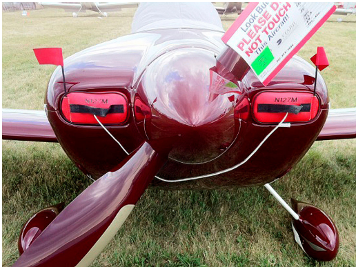
Van's RV-8 Engine Inlet Plugs