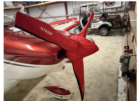
Van's RV-9 Insulated Prop Cover, 3-Blade