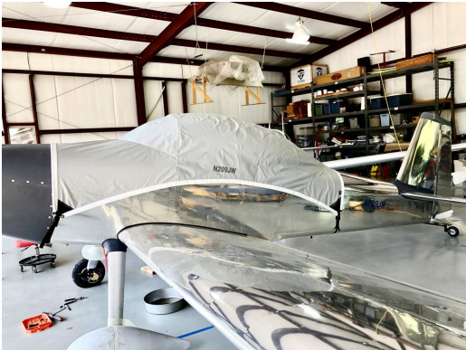
Van's RV-8 Light Weight Travel Canopy Cover

Travel Covers are made with Silver Solution-Dyed Polyester fabric and only lined over the windshield to save weight. The material is lightweight and more compact for easy stowage in the aircraft. The polyester material is water resistant, but only intended for occasional use outside. We also have an ultra lightweight material available for fitted hangar dust covers. For daily outdoor use, the non-travel Sunbrella Cover is the best choice.