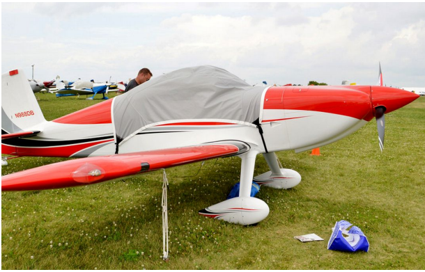
Van's RV-8 Travel Canopy Cover, Fastback Model

Travel Covers are made with Silver Solution-Dyed Polyester fabric and only lined over the windshield to save weight. The material is lightweight and more compact for easy stowage in the aircraft. The polyester material is water resistant, but only intended for occasional use outside. We also have an ultra lightweight material available for fitted hangar dust covers. For daily outdoor use, the non-travel Sunbrella Cover is the best choice.