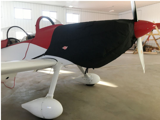
Van's RV-8 Insulated Engine Cover

This cover type is made from Silver Acrylic Sunbrella canvas and is 100% lined with a soft and smooth microfiber. Bruce's Custom Covers developed this material combination especially for aircraft protection. The outer material is medium weight and treated for water resistance, UV resistance and anti-static buildup. The inner lining is a very soft and smooth microfiber to prevent scratching. The material is very reflective, and tests show that the cabin interior temperature can be reduced to near-ambient temperature on the hottest of days. It is water, ice and snow repellent, yet breathable to allow moisture to escape from between the cover and the aircraft surface.