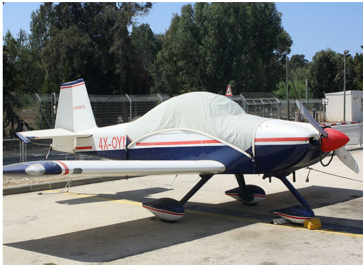
Van's RV-8 Canopy Cover

This cover type is made from Silver Acrylic Sunbrella canvas and is 100% lined with a soft and smooth microfiber. Bruce's Custom Covers developed this material combination especially for aircraft protection. The outer material is medium weight and treated for water resistance, UV resistance and anti-static buildup. The inner lining is a very soft and smooth microfiber to prevent scratching. The material is very reflective, and tests show that the cabin interior temperature can be reduced to near-ambient temperature on the hottest of days. It is water, ice and snow repellent, yet breathable to allow moisture to escape from between the cover and the aircraft surface.