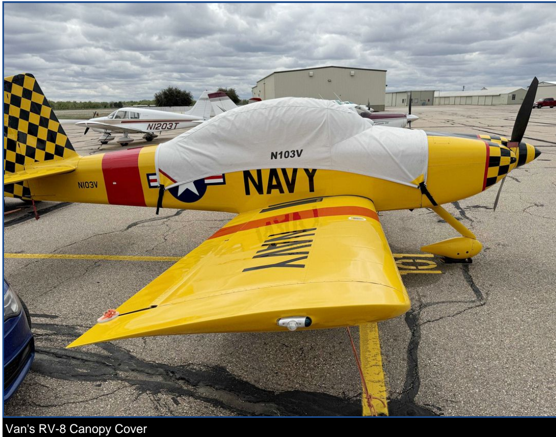
Van's RV-8 Canopy Cover