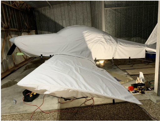
Van's RV-8 Complete Fuselage Cover with Detachable Wing Covers

This cover type is made from Silver Acrylic Sunbrella canvas and is 100% lined with a soft and smooth microfiber. Bruce's Custom Covers developed this material combination especially for aircraft protection. The outer material is medium weight and treated for water resistance, UV resistance and anti-static buildup. The inner lining is a very soft and smooth microfiber to prevent scratching. The material is very reflective, and tests show that the cabin interior temperature can be reduced to near-ambient temperature on the hottest of days. It is water, ice and snow repellent, yet breathable to allow moisture to escape from between the cover and the aircraft surface.