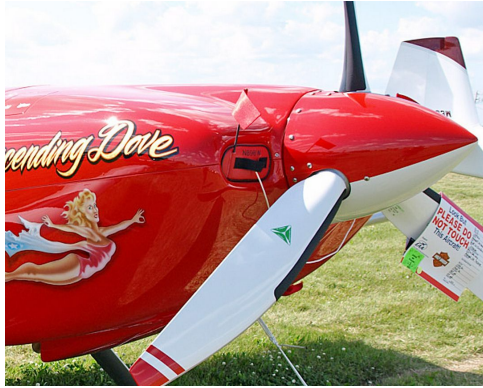
Van's RV-8 Engine Inlet Plugs

Engine Inlet Plugs are custom fit for your Van's Aircraft RV-8/8A intakes, made with heavy-duty vinyl material, and stuffed with a single block of sculpted urethane foam. Each plug has a zipper that allows the foam to be removed and dried if necessary. Engine plugs have warning flags that are visible from the cockpit or 'remove before flight' streamers sewn onto the face of the plugs. Most plugs are imprinted with the aircraft registration number in black for an extra charge. Storage bag NOT included. Engine plugs may be inserted after flight when the engine is still warm. Engine Inlet Plugs are commonly referred to as Cowl Plugs, Intake Plugs, Cowl Blocks, Engine Blocks, and Engine Bungs.