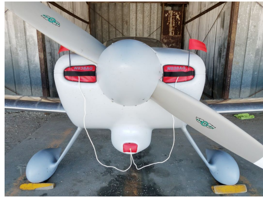
Van's RV-9 Engine Inlet Plugs