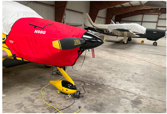
Van's Aircraft RV-7/7A Insulated Engine Cover