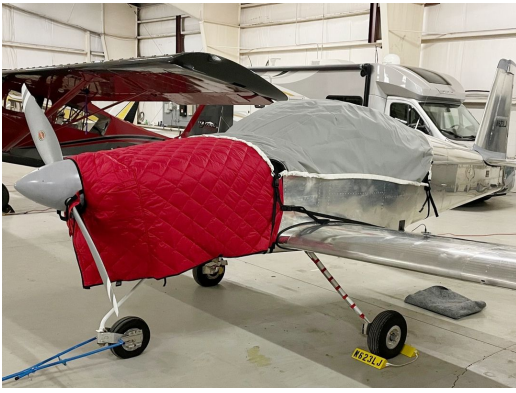
Van's RV-7 Travel Canopy Cover, Hangar Blanket