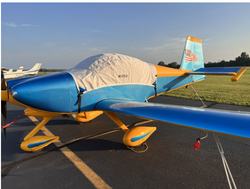
Van's RV9A Canopy Cover

This cover type is made from Silver Acrylic Sunbrella canvas and is 100% lined with a soft and smooth microfiber. Bruce's Custom Covers developed this material combination especially for aircraft protection. The outer material is medium weight and treated for water resistance, UV resistance and anti-static buildup. The inner lining is a very soft and smooth microfiber to prevent scratching. The material is very reflective, and tests show that the cabin interior temperature can be reduced to near-ambient temperature on the hottest of days. It is water, ice and snow repellent, yet breathable to allow moisture to escape from between the cover and the aircraft surface.