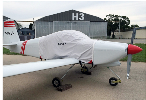
Van's Aircraft RV-9/9A Extended Canopy Cover