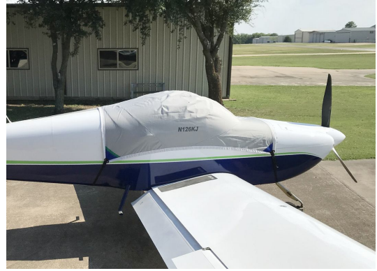
Van's RV-9A Travel Weight Canopy Cover