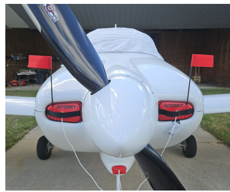
Van's Aircraft RV-9/9A Engine Inlet Plugs