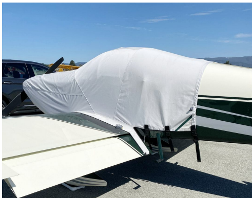
Van's RV-9A Extended Canopy/Engine Cover

This cover type is made from Silver Acrylic Sunbrella canvas and is 100% lined with a soft and smooth microfiber. Bruce's Custom Covers developed this material combination especially for aircraft protection. The outer material is medium weight and treated for water resistance, UV resistance and anti-static buildup. The inner lining is a very soft and smooth microfiber to prevent scratching. The material is very reflective, and tests show that the cabin interior temperature can be reduced to near-ambient temperature on the hottest of days. It is water, ice and snow repellent, yet breathable to allow moisture to escape from between the cover and the aircraft surface.