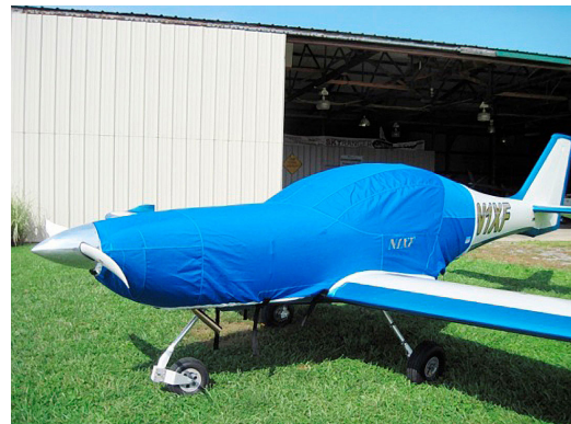
Arion Lightning Extended Canopy/Engine Cover