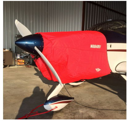
Van's RV-9A Insulated Engine Cover