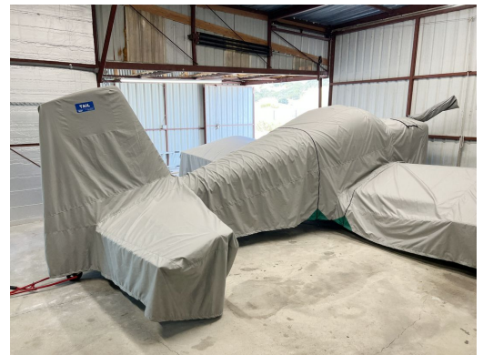
Van's Aircraft RV-7 Hangar Use Dust Cover