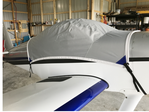
Van's Aircraft RV-9 Travel Cover, Light Weight Travel Canopy Cover