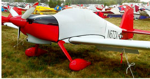
Light Weight Fitted Hangar Dust Cover

lightweight and more compact for easy stowage in the aircraft. The polyester material is water resistant, but only intended for occasional use outside. We also have an ultra lightweight material available for fitted hangar dust covers. For daily outdoor use, the non-travel Sunbrella Cover is the best choice.