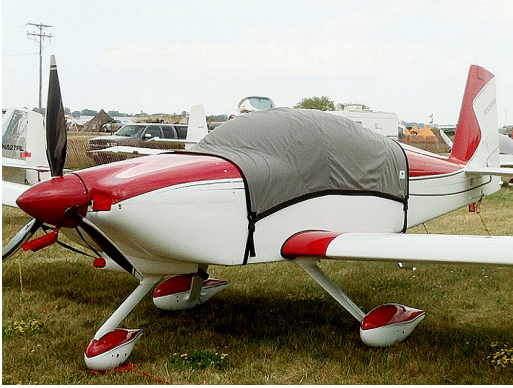
Van's RV-9 Travel Canopy Cover

lightweight and more compact for easy stowage in the aircraft. The polyester material is water resistant, but only intended for occasional use outside. We also have an ultra lightweight material available for fitted hangar dust covers. For daily outdoor use, the non-travel Sunbrella Cover is the best choice.