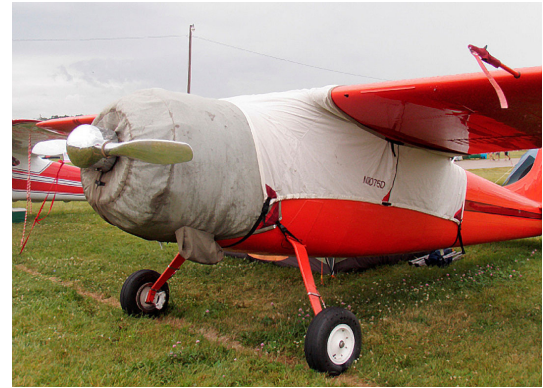
Cessna 195 Over-Top Canopy Cover & Engine Cover