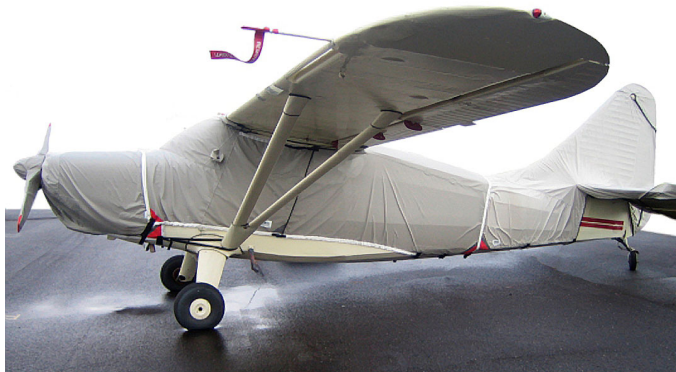
Stinson 108 Canopy, Engine, Prop & Empennage Covers

Stinson S-10 & S-10A Models Pitot Tube Covers , NOT HEAT RESISTANT TYPE, are made of Naugahyde vinyl, and are designed to cover the entire pitot assembly. Slipping over the tube, the cover tightens around the base with a Velcro strap detail. A "Remove Before Flight" streamer is attached to the cover. Heat Resistant Pitot Covers are an upgrade to this design, and help prevent the pitot cover from melting onto the tube if the pitot heat is accidentally turned on while installed. If you want the set tethered together, please let us know.