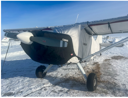
Stinson 108 Winter Cover Set