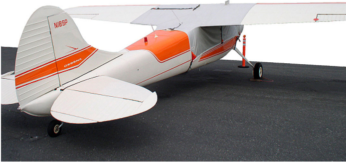
Cessna 195 Over-Top Canopy, Engine & Prop Covers

The material is very reflective, and tests show that the cabin interior temperature can be reduced to near-ambient temperature on the hottest of days. It is water, ice and snow repellent, yet breathable to allow moisture to escape from between the cover and the aircraft surface.