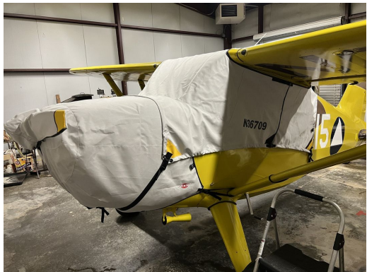
Stinson 10 Canopy, Engine & Prop Covers

This cover type is made from Silver Acrylic Sunbrella canvas and is 100% lined with a soft and smooth microfiber. Bruce's Custom Covers developed this material combination especially for aircraft protection. The outer material is medium weight and treated for water resistance, UV resistance and anti-static buildup. The inner lining is a very soft and smooth microfiber to prevent scratching. The material is very reflective, and tests show that the cabin interior temperature can be reduced to near-ambient temperature on the hottest of days. It is water, ice and snow repellent, yet breathable to allow moisture to escape from between the cover and the aircraft surface.