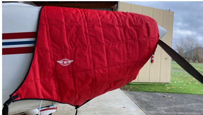
Stinson 108 Insulated Engine Cover