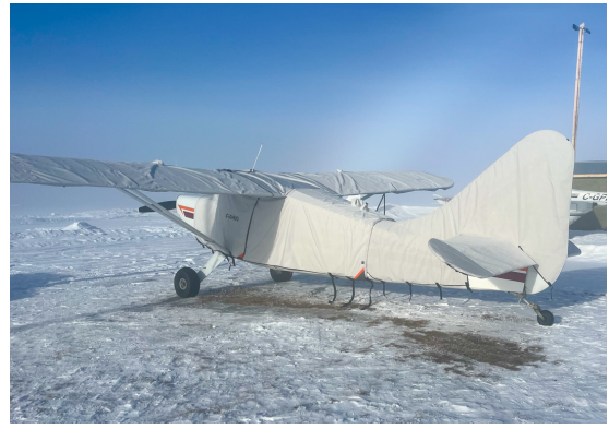
Stinson 108 Winter Cover Set