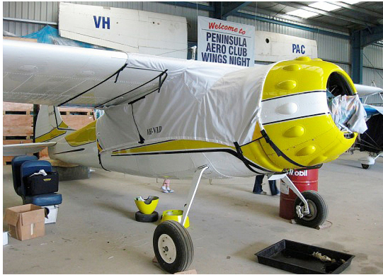
Cessna 195 Canopy Cover, over-top, 24" fwd ext to cover cowl ring gap, gas cap ext.

The material is very reflective, and tests show that the cabin interior temperature can be reduced to near-ambient temperature on the hottest of days. It is water, ice and snow repellent, yet breathable to allow moisture to escape from between the cover and the aircraft surface.