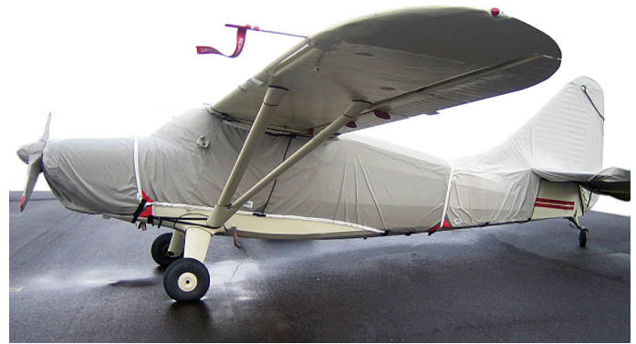
Stinson 108 Canopy, Engine, Prop & Empennage Covers