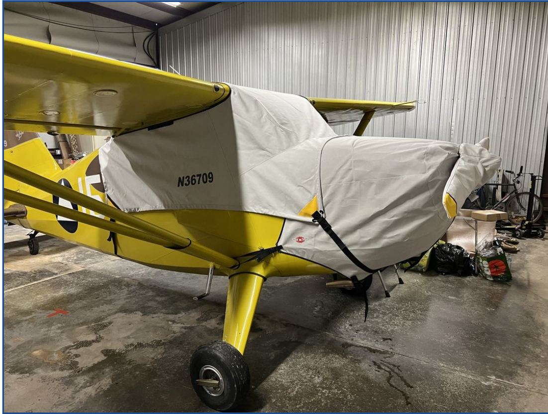
Stinson 10 Canopy, Engine &amp; Prop Covers