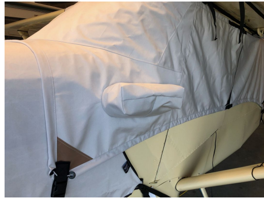
Stinson 108 Over-Top Canopy Cover, Engine Cover