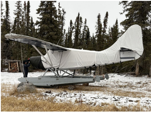
Stinson 108 Cover Set