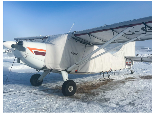
Stinson 108 Winter Cover Set