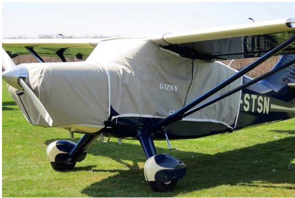
Stinson 108 Canopy & Engine Cover