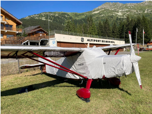
Stinson 108-3 Voyager Cover Set