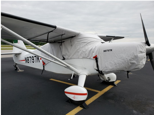
Stinson 108 Voyager Canopy Cover with wing extensions, Engine Cover