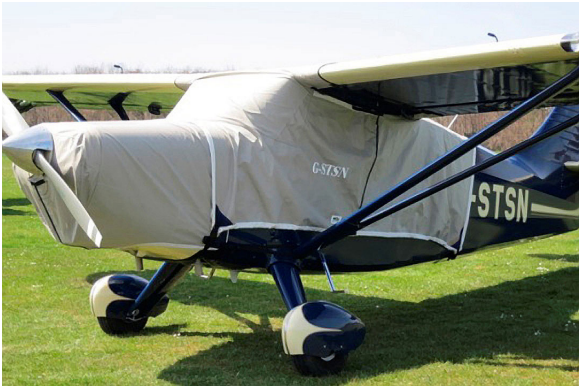
Stinson 108 Canopy & Engine Cover

This cover type is made from Silver Acrylic Sunbrella canvas and is 100% lined with a soft and smooth microfiber. Bruce's Custom Covers developed this material combination especially for aircraft protection. The outer material is medium weight and treated for water resistance, UV resistance and anti-static buildup. The inner lining is a very soft and smooth microfiber to prevent scratching. The material is very reflective, and tests show that the cabin interior temperature can be reduced to near-ambient temperature on the hottest of days. It is water, ice and snow repellent, yet breathable to allow moisture to escape from between the cover and the aircraft surface.