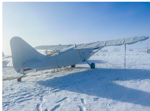
Stinson 108 Winter Cover Set