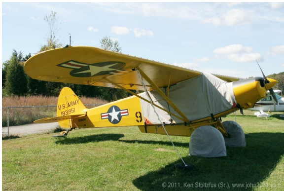
Piper L-21b Extended Canopy Cover, Tire Covers

ALL-YEAR USE MATERIAL - Made with Silver Acrylic Sunbrella canvas, the all-year use material is the best option for sun protection and cover longevity. This heavier more durable material is intended for all weather conditions, such as rain and snow or lots of sun.