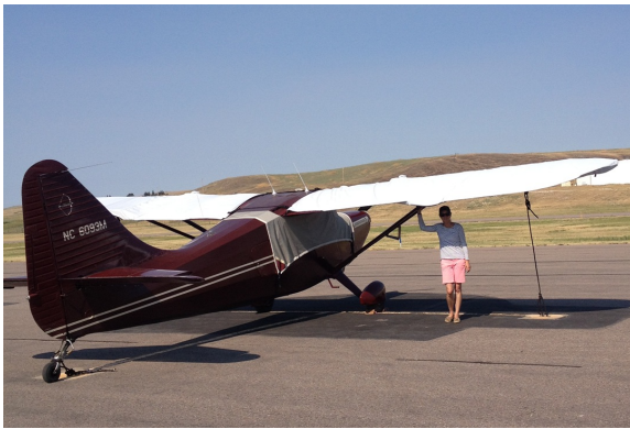
Stinson 108 Canopy Cover & Wing Covers

This cover type is made from Silver Acrylic Sunbrella canvas and is 100% lined with a soft and smooth microfiber. Bruce's Custom Covers developed this material combination especially for aircraft protection. The outer material is medium weight and treated for water resistance, UV resistance and anti-static buildup. The inner lining is a very soft and smooth microfiber to prevent scratching. The material is very reflective, and tests show that the cabin interior temperature can be reduced to near-ambient temperature on the hottest of days. It is water, ice and snow repellent, yet breathable to allow moisture to escape from between the cover and the aircraft surface.