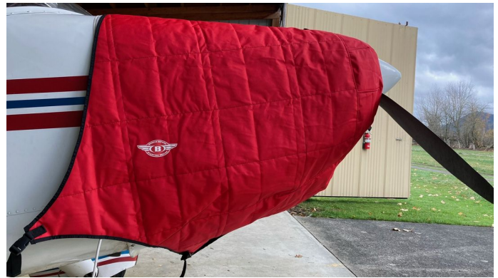
Stinson 108 Insulated Engine Cover