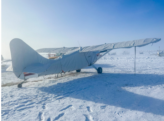
Stinson 108 Winter Cover Set

WINTER USE MATERIAL - Made with Solution-Dyed Polyester fabric, this option is intended for seasonal use to aid in deicing, rain mitigation, or for occasional travel. The material is lighter and more compact, but more susceptible to UV damage and may have a shorter useful life if used continuously outside than the all-year use material.