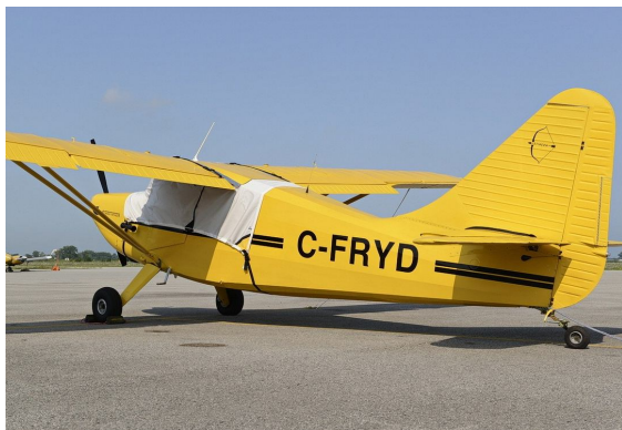
Stinson 108 Voyager Canopy Cover, Wrap-Around Type