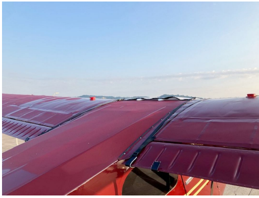
Stinson 108 Windshield Cover