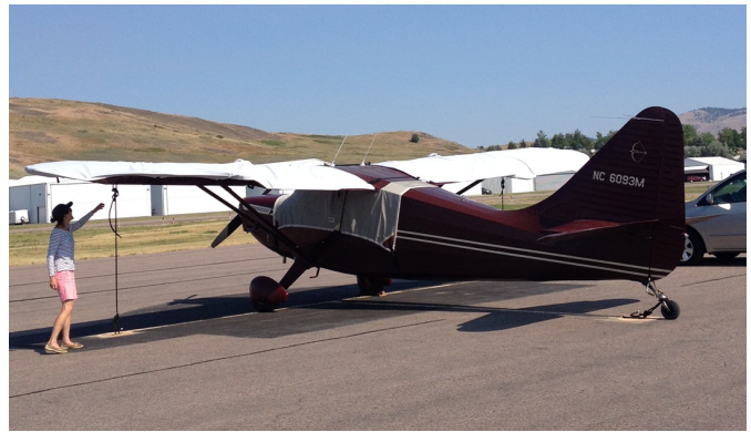
Stinson 108 Canopy Cover & Wing Covers