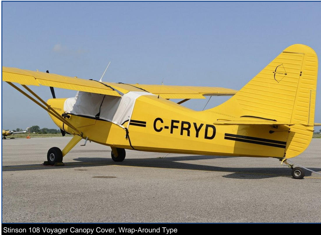
Stinson 108 Voyager Canopy Cover, Wrap-Around Type