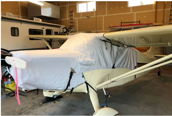
Stinson 108 Over-Top Canopy Cover, Engine Cover

This cover type is made from Silver Acrylic Sunbrella canvas and is 100% lined with a soft and smooth microfiber. Bruce's Custom Covers developed this material combination especially for aircraft protection. The outer material is medium weight and treated for water resistance, UV resistance and anti-static buildup. The inner lining is a very soft and smooth microfiber to prevent scratching. The material is very reflective, and tests show that the cabin interior temperature can be reduced to near-ambient temperature on the hottest of days. It is water, ice and snow repellent, yet breathable to allow moisture to escape from between the cover and the aircraft surface.