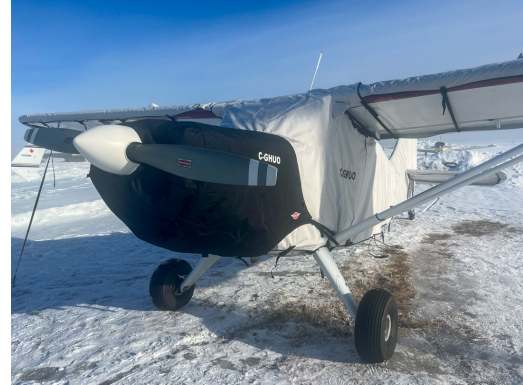
Stinson 108 Winter Cover Set