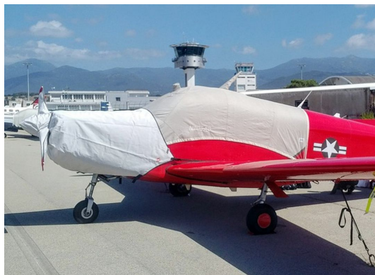
Siai Marchetti S.205/208 Canopy, Engine & Prop Covers