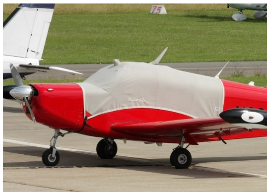
Siai Marchetti S.205/208 Canopy Cover

Travel Covers are made with Silver Solution-Dyed Polyester fabric and only lined over the windshield to save weight. The material is lightweight and more compact for easy stowage in the aircraft. The polyester material is water resistant, but only intended for occasional use outside. We also have an ultra lightweight material available for fitted hangar dust covers. For daily outdoor use, the non-travel Sunbrella Cover is the best choice.