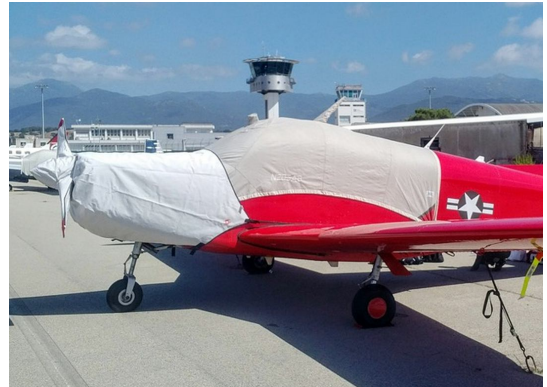
Siai Marchetti S.205/208 Canopy, Engine & Prop Covers