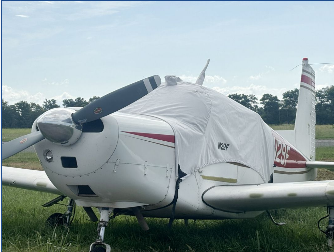
Siai-Marchetti S.205 Canopy Cover