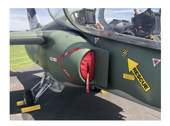
Siai Marchetti S-211 Engine Plugs

The Engine Inlet Plugs are custom fit for your Siai Marchetti S-211 intakes, made with heavy-duty vinyl material, and stuffed with a single block of sculpted urethane foam. Each plug has a zipper that allows the foam to be removed and dried if necessary. Engine plugs have 'remove before flight' streamers sewn onto the face of the plugs. Most plugs are imprinted with the aircraft registration number in black for an extra charge. Storage bag NOT included. Engine plugs may be inserted after flight when the engine is still warm. Engine Inlet Plugs are commonly referred to as Cowl Plugs, Intake Plugs, Cowl Blocks, Engine Blocks, and Engine Bungs.