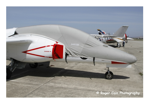
S-211 Canopy/Nose Cover & Engine Plugs