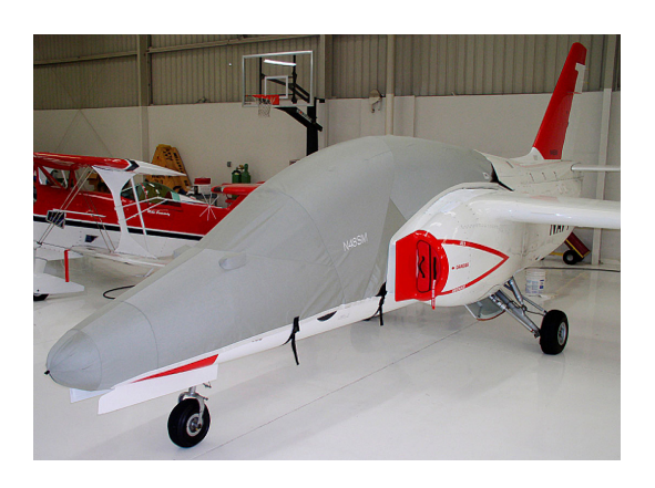
S-211 Canopy/Nose Cover & Engine Plugs