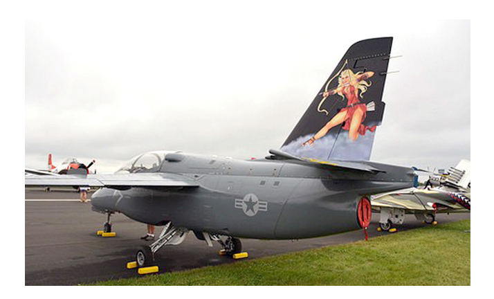
Siai Marchetti S-211 Exhaust Plug