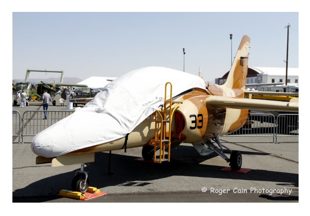
Siai Marchetti S-211 Canopy/Nose Cover