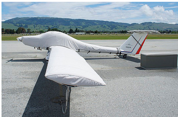
Grob 109 Canopy/Engine w/ extension to tail, Wing, Stabilizer & Prop/Spinner Covers

This cover type is made from Silver Acrylic Sunbrella canvas and is 100% lined with a soft and smooth microfiber. Bruce's Custom Covers developed this material combination especially for aircraft protection. The outer material is medium weight and treated for water resistance, UV resistance and anti-static buildup. The inner lining is a very soft and smooth microfiber to prevent scratching. The material is very reflective, and tests show that the cabin interior temperature can be reduced to near-ambient temperature on the hottest of days. It is water, ice and snow repellent, yet breathable to allow moisture to escape from between the cover and the aircraft surface.