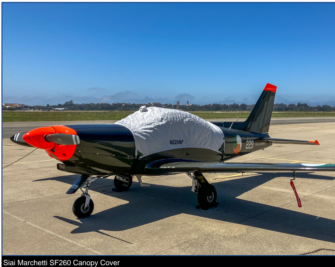
Siai Marchetti SF260 Canopy Cover