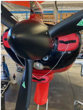
Siai Marchetti SF260 Engine Plugs