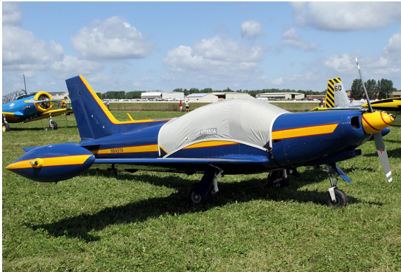
Siai Marchetti SF260 Canopy Cover