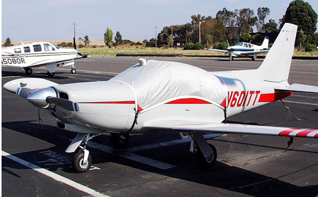
Standard Canopy Cover for Marchetti SF260