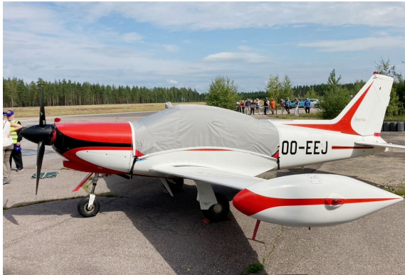
Siai Marchetti SF260 Light Weight Travel Canopy Cover

Travel Covers are made with Silver Solution-Dyed Polyester fabric and only lined over the windshield to save weight. The material is lightweight and more compact for easy stowage in the aircraft. The polyester material is water resistant, but only intended for occasional use outside. We also have an ultra lightweight material available for fitted hangar dust covers. For daily outdoor use, the non-travel Sunbrella Cover is the best choice.