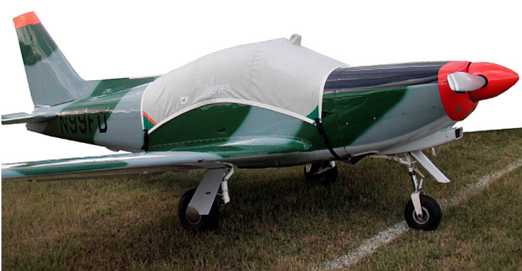
Standard Canopy Cover

This cover type is made from Silver Acrylic Sunbrella canvas and is 100% lined with a soft and smooth microfiber. Bruce's Custom Covers developed this material combination especially for aircraft protection. The outer material is medium weight and treated for water resistance, UV resistance and anti-static buildup. The inner lining is a very soft and smooth microfiber to prevent scratching. The material is very reflective, and tests show that the cabin interior temperature can be reduced to near-ambient temperature on the hottest of days. It is water, ice and snow repellent, yet breathable to allow moisture to escape from between the cover and the aircraft surface.