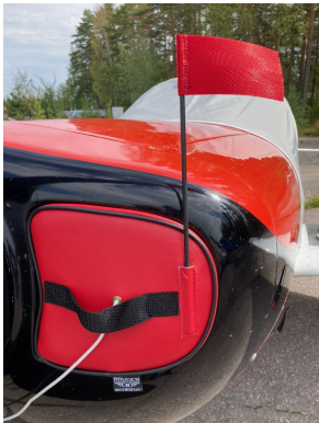
Siai Marchetti SF260 Engine Plugs

Engine Inlet Plugs are custom fit for your Siai Marchetti SF260 intakes, made with heavy-duty vinyl material, and stuffed with a single block of sculpted urethane foam. Each plug has a zipper that allows the foam to be removed and dried if necessary. Engine plugs have warning flags that are visible from the cockpit or 'remove before flight' streamers sewn onto the face of the plugs. Most plugs are imprinted with the aircraft registration number in black for an extra charge. Storage bag NOT included. Engine plugs may be inserted after flight when the engine is still warm. Engine Inlet Plugs are commonly referred to as Cowl Plugs, Intake Plugs, Cowl Blocks, Engine Blocks, and Engine Bungs.