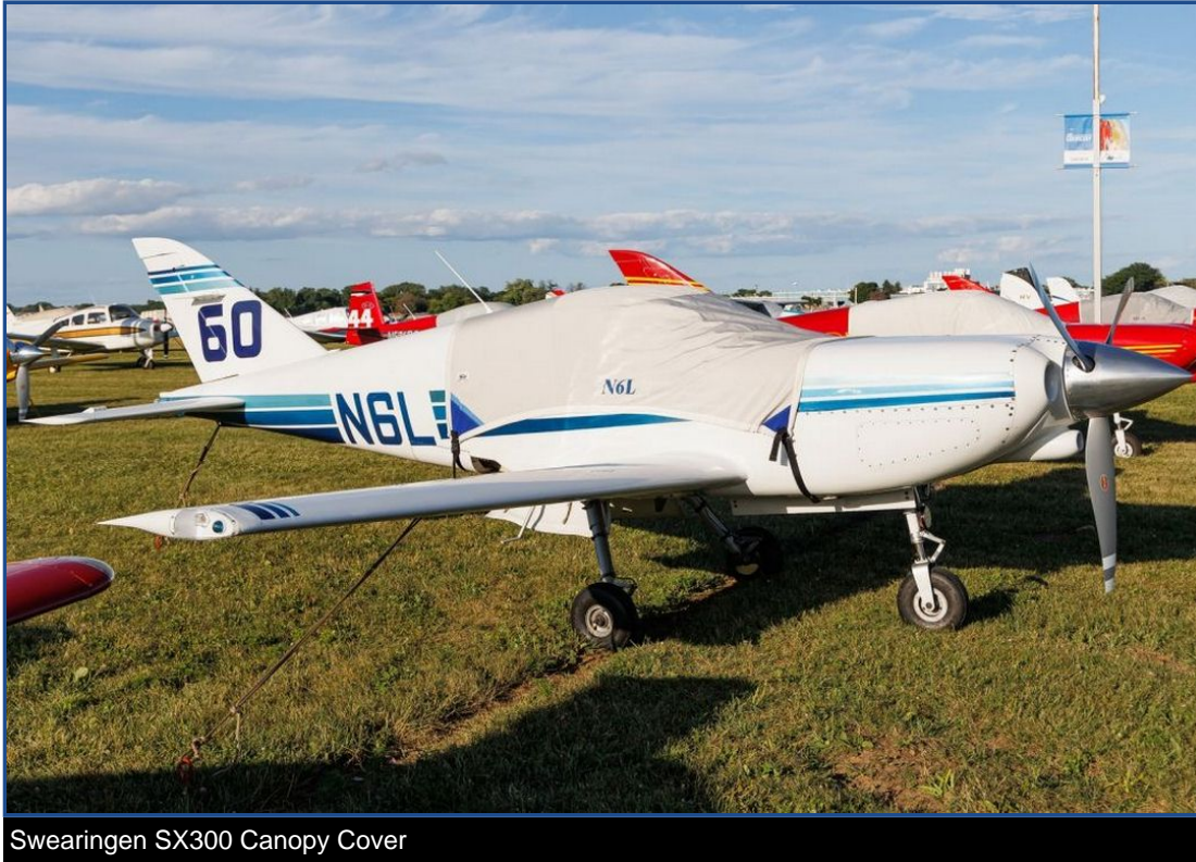
Swearingen SX300 Canopy Cover