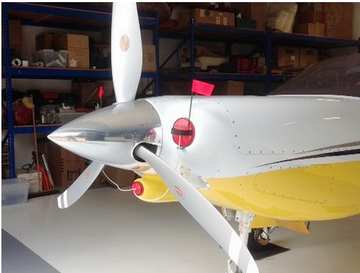
Swearingen SX300 Engine Inlet Plugs