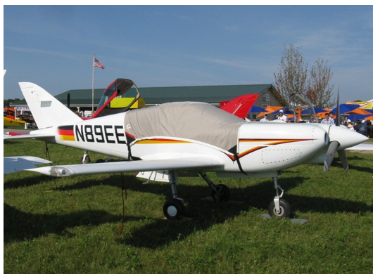
The Swearingen SX300 Canopy Cover

Travel Covers are made with Silver Solution-Dyed Polyester fabric and only lined over the windshield to save weight. The material is lightweight and more compact for easy stowage in the aircraft. The polyester material is water resistant, but only intended for occasional use outside. We also have an ultra lightweight material available for fitted hangar dust covers. For daily outdoor use, the non-travel Sunbrella Cover is the best choice.