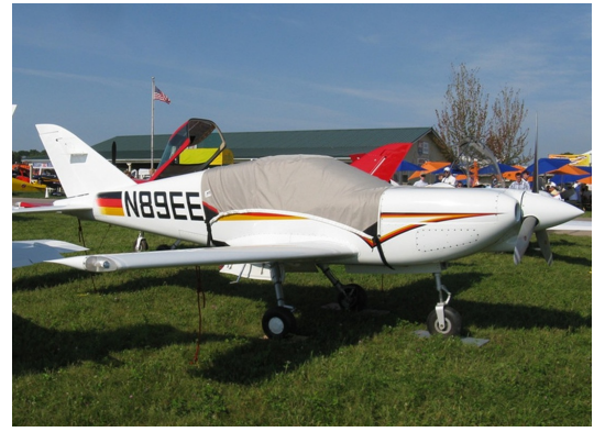
The Swearingen SX300 Canopy Cover