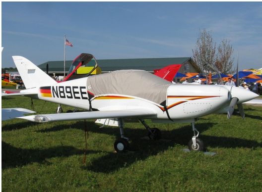
The Swearingen SX300 Canopy Cover