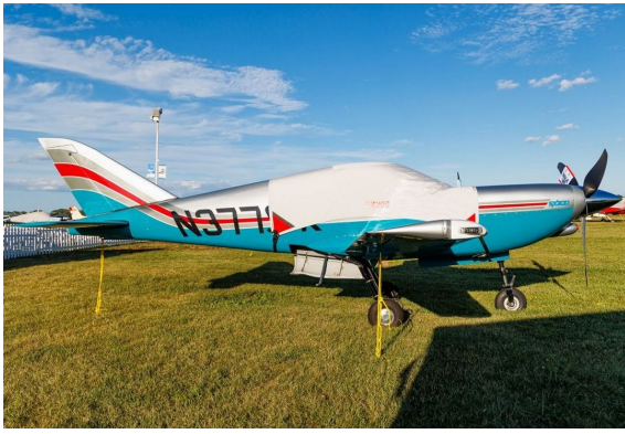
Swearingen SX300 Canopy Cover