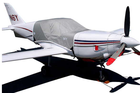
The Swearingen SX300 Canopy Cover, Engine Plugs & Prop Ties