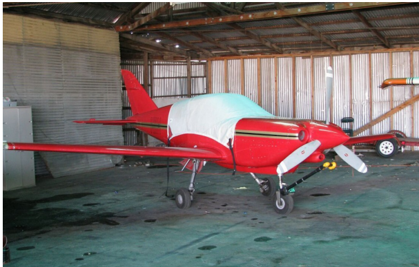
The Swearingen SX300 Canopy Cover