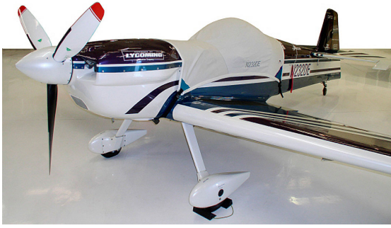
Cap 232 Canopy Cover