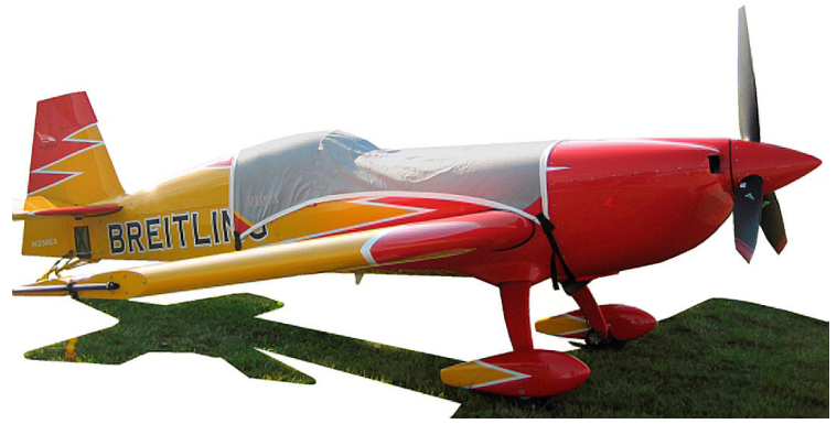
Extra 300sc Canopy Cover