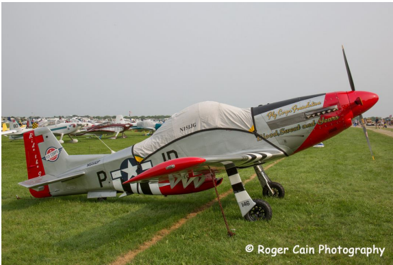
Titan Mustang Canopy Cover

Covers developed this material combination especially for aircraft protection. The outer material is medium weight and treated for water resistance, UV resistance and anti-static buildup. The inner lining is a very soft and smooth microfiber to prevent scratching. The material is very reflective, and tests show that the cabin interior temperature can be reduced to near-ambient temperature on the hottest of days. It is water, ice and snow repellent, yet breathable to allow moisture to escape from between the cover and the aircraft surface.