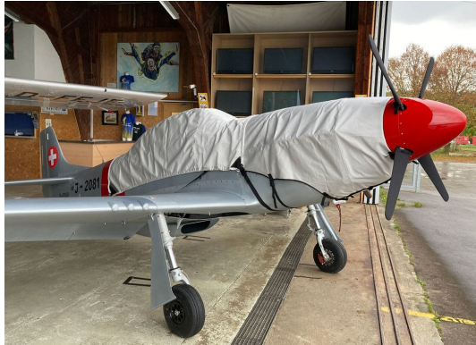
SW-51 Mustang Canopy & Engine Covers

This cover type is made from Silver Acrylic Sunbrella canvas and is 100% lined with a soft and smooth microfiber. Bruce's Custom Covers developed this material combination especially for aircraft protection. The outer material is medium weight and treated for water resistance, UV resistance and anti-static buildup. The inner lining is a very soft and smooth microfiber to prevent scratching. The material is very reflective, and tests show that the cabin interior temperature can be reduced to near-ambient temperature on the hottest of days. It is water, ice and snow repellent, yet breathable to allow moisture to escape from between the cover and the aircraft surface.