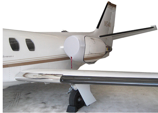
Cessna Citation "Bikini" Type Engine Covers: Extremely Light & Portable