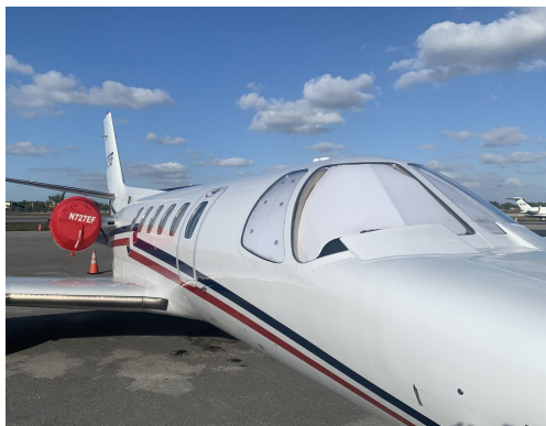
Cessna Citation S550

Custom-made Heatshield Sunshades are available for almost any window in the jet. Side windows, Skylights, and Emergency Exits are all custom-made. The product is a unique composite of closed-cell foam with a silver mylar finish. The set is easily stored in the included storage sleeve. Some designs may require velcro and suction cups. Our Heatshields are offered white side out since aircraft manufacturers have issued advisories against reflective window inserts due to potential heat damage.