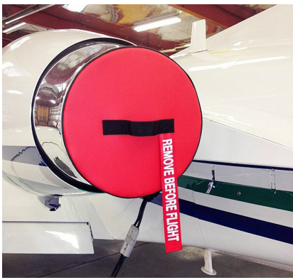
Cessna Citation S2 Exhaust Plugs