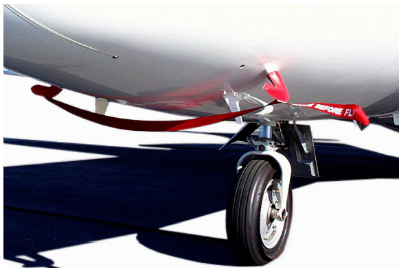
Cessna Citation I Pitot Covers