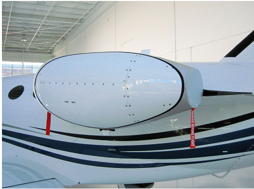
Cessna 510 Mustang Bikini Type Engine Cover

and dried if necessary. Engine plugs have 'remove before flight' streamers sewn onto the face of the plugs. Most plugs are imprinted with the aircraft registration number in black. Engine plugs may be inserted after flight when the engine is still warm. Engine Inlet Plugs are commonly referred to as Cowl Plugs, Intake Plugs, Cowl Blocks, Engine Blocks, and Engine Bungs.