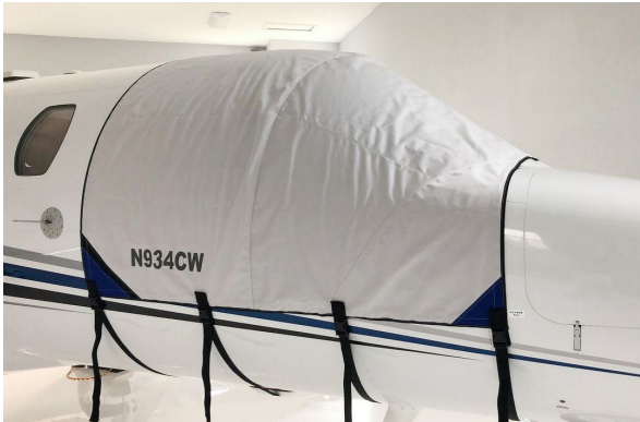
Cessna Citation M2 Cockpit Cover

This cover type is made from Silver Acrylic Sunbrella canvas and is 100% lined with a soft and smooth microfiber. Bruce's Custom Covers developed this material combination especially for aircraft protection. The outer material is medium weight and treated for water resistance, UV resistance and anti-static buildup. The inner lining is a very soft and smooth microfiber to prevent scratching. The material is very reflective, and tests show that the cabin interior temperature can be reduced to near-ambient temperature on the hottest of days. It is water, ice and snow repellent, yet breathable to allow moisture to escape from between the cover and the aircraft surface.