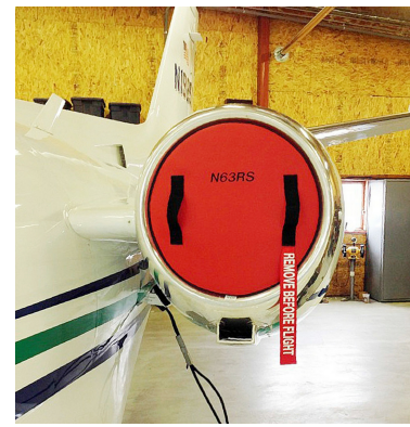
Cessna Citation S2 Intake Plugs