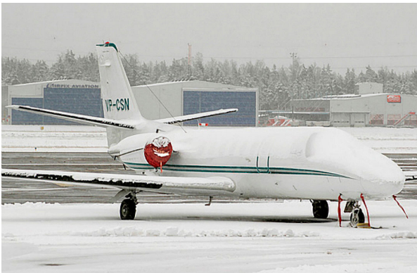
Cessna 560 Engine Inlet/Exhaust Covers, Pitot Cover Set