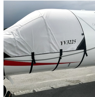
Cessna Citationjet V Ultra (560) Cockpit Cover