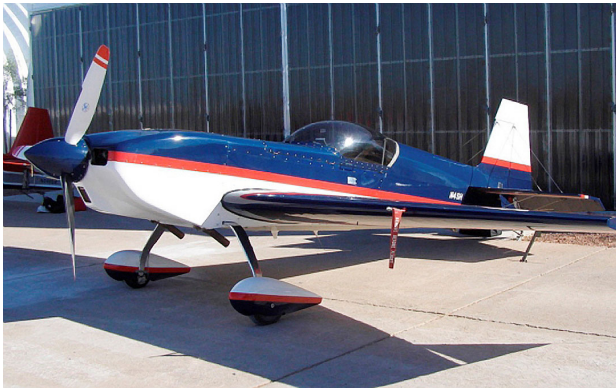
Covers & Plugs for the Staudacher S-600