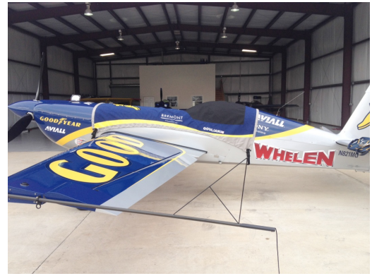
Extra 300SC with NASCAR style custom cover