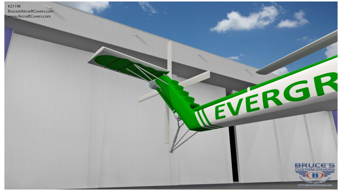
Sikorsky S-64 Skycrane, CH-54 Tarhe Insulated Engine, Rotor Sikorsky S-64 Canopy/Nose, Engine Area, Blade, Rotor, Tail Rotor Hub, Tailboom, Stabilizer & Tail Rotor Covers Sikorsky S-64 Skycrane, CH-54 Tarhe Insulated Engine, Rotor Sikorsky S-64 Canopy/Nose, Engine Area, Blade, Rotor, Tail Rotor Hub, Tailboom, Stabilizer & Tail Rotor Covers (illustration)