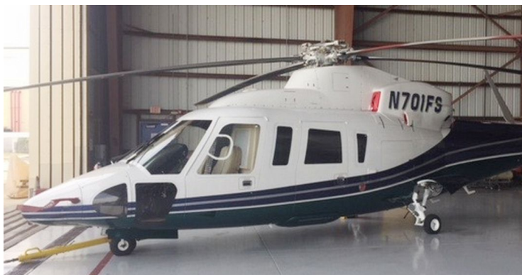
Sikorsky S76 (All Models) Intake Plugs (S76c Models)