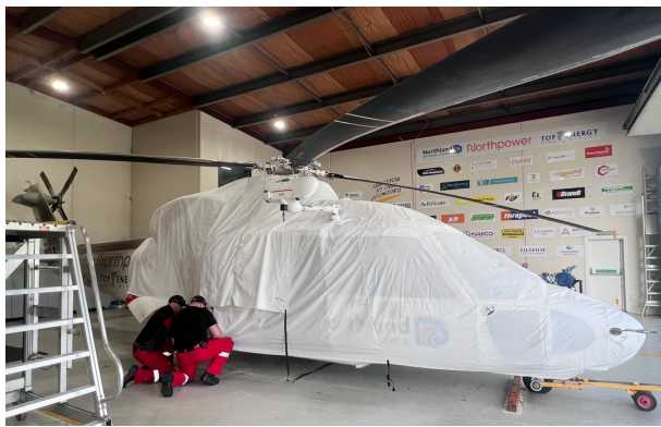
Sikorsky S76C Forward Canopy Cover, Engine Cover (test fit covers)