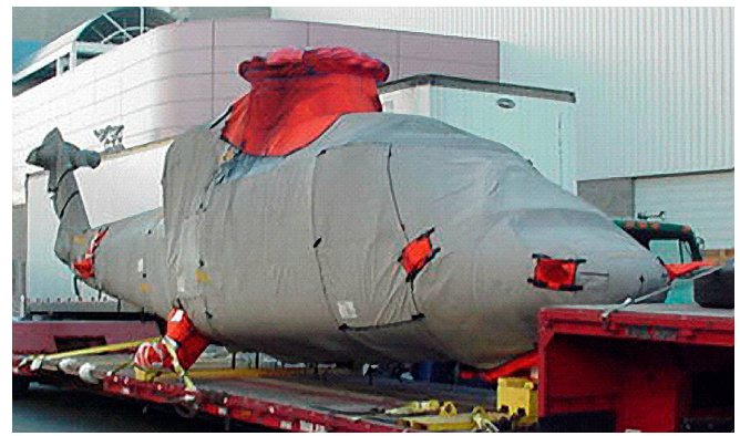
S76 Full Body Transport Cover