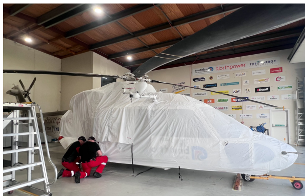
Sikorsky S76C Forward Canopy Cover, Engine Cover (test fit covers)

Travel Covers are made with Silver Solution-Dyed Polyester fabric and fully lined over the entire cover. The material is lightweight and more compact for easy stowage in the aircraft. The polyester material is water resistant, but only intended for occasional use outside. We also have an ultra lightweight material available for fitted hangar dust covers. For daily outdoor use, the non-travel Sunbrella Cover is the best choice.