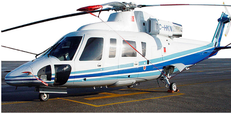
S76 Blade Tie-Downs and Pitot Cover set

WINTER USE MATERIAL - Made with Solution-Dyed Polyester fabric, this option is intended for seasonal use to aid in deicing, rain mitigation, or for occasional travel. The material is lighter and more compact, but more susceptible to UV damage and may have a shorter useful life if used continuously outside than the all-year use material.