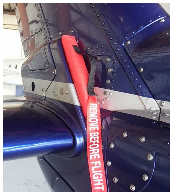
S76 Tail Wedge Plug

The Engine Inlet Plugs are custom fit for your Sikorsky S76 (All Models) intakes, made with heavy-duty vinyl material, and stuffed with a single block of sculpted urethane foam. Each plug has a zipper that allows the foam to be removed and dried if necessary. Engine plugs have 'Remove Before Flight' streamers sewn onto the face of the plugs. Most plugs are imprinted with the aircraft registration number in black for an extra charge. Storage bag NOT included. Engine plugs may be inserted after flight when the engine is still warm. Engine Inlet Plugs are commonly referred to as Cowl Plugs, Intake Plugs, Cowl Blocks, Engine Blocks, and Engine Bungs.