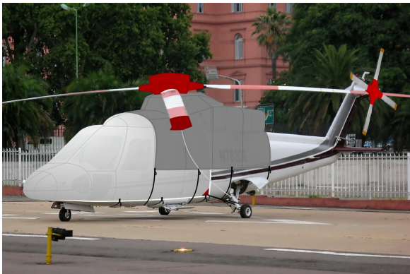
S76 Forward Fuselage, Engine, Main & Tail Rotor Hub Covers (illustration)

WINTER USE MATERIAL - Made with Solution-Dyed Polyester fabric, this option is intended for seasonal use to aid in deicing, rain mitigation, or for occasional travel. The material is lighter and more compact, but more susceptible to UV damage and may have a shorter useful life if used continuously outside than the all-year use material.