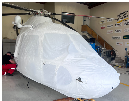
Sikorsky S76C Forward Canopy Cover, Engine Cover (test fit covers)