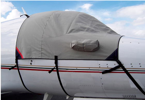
Sabre Cockpit Cover

This cover type is made from Silver Acrylic Sunbrella canvas and is 100% lined with a soft and smooth microfiber. Bruce's Custom Covers developed this material combination especially for aircraft protection. The outer material is medium weight and treated for water resistance, UV resistance and anti-static buildup. The inner lining is a very soft and smooth microfiber to prevent scratching. The material is very reflective, and tests show that the cabin interior temperature can be reduced to near-ambient temperature on the hottest of days. It is water, ice and snow repellent, yet breathable to allow moisture to escape from between the cover and the aircraft surface.