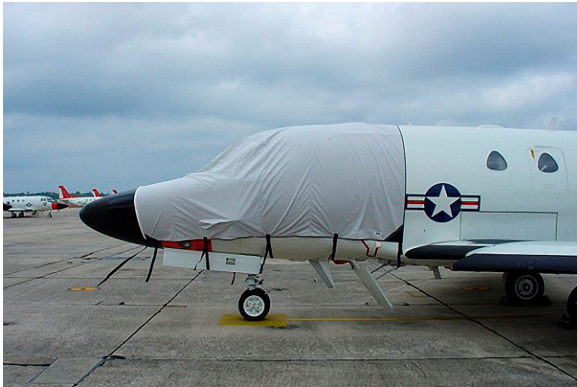
Sabre 40 Cockpit Cover

This cover type is made from Silver Acrylic Sunbrella canvas and is 100% lined with a soft and smooth microfiber. Bruce's Custom Covers developed this material combination especially for aircraft protection. The outer material is medium weight and treated for water resistance, UV resistance and anti-static buildup. The inner lining is a very soft and smooth microfiber to prevent scratching. The material is very reflective, and tests show that the cabin interior temperature can be reduced to near-ambient temperature on the hottest of days. It is water, ice and snow repellent, yet breathable to allow moisture to escape from between the cover and the aircraft surface.