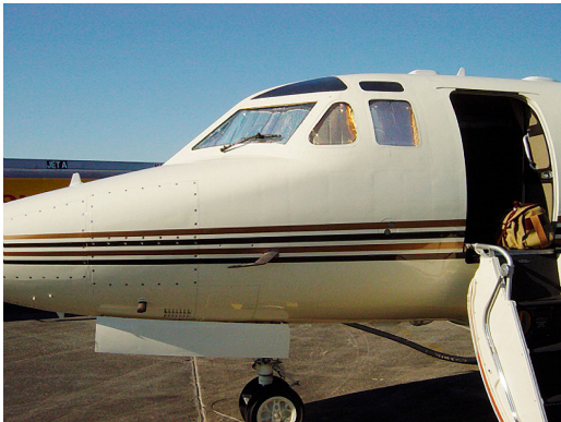
Sabre Cockpit HeatShields Set

Heatshields are interior sunshades for an aircraft's windows or canopy glass. The product is a unique composite of closed-cell foam with a silver mylar finish. The semi-rigid design is stiff enough to stand along the inside of the windshield using sun visors or window framing. It folds up flat and easily stores in the included storage sleeve. Some designs may require velcro and suction cups. A Heatshield is an excellent short-term remedy for cockpit overheating.