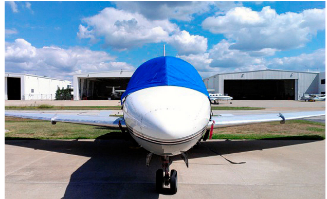
Rockwell Sabre Cockpit/Door Cover