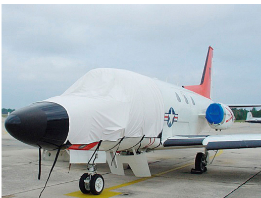
Sabre 40 Cockpit and Engine Covers set