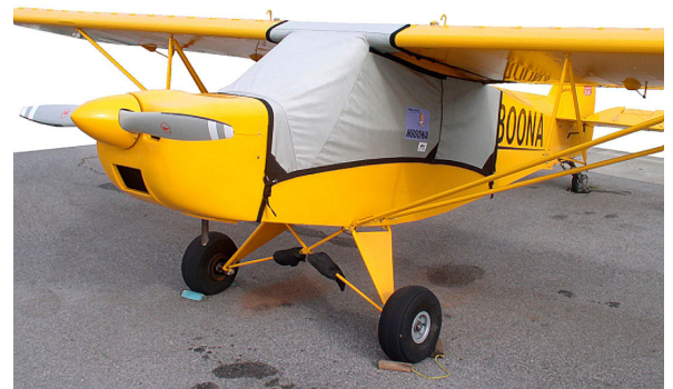
Zlin Savage Canopy Cover