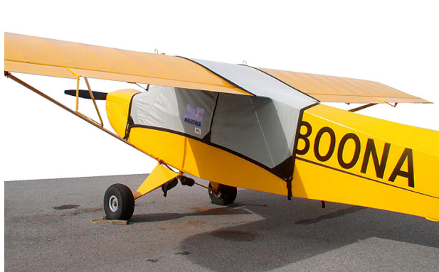
Zlin Savage Over-Top Canopy Cover

This cover type is made from Silver Acrylic Sunbrella canvas and is 100% lined with a soft and smooth microfiber. Bruce's Custom Covers developed this material combination especially for aircraft protection. The outer material is medium weight and treated for water resistance, UV resistance and anti-static buildup. The inner lining is a very soft and smooth microfiber to prevent scratching. The material is very reflective, and tests show that the cabin interior temperature can be reduced to near-ambient temperature on the hottest of days. It is water, ice and snow repellent, yet breathable to allow moisture to escape from between the cover and the aircraft surface.