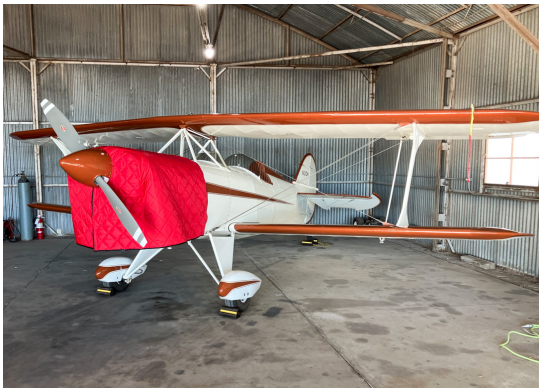
SKYBOLT, Insulated Hangar Blanket, Custom Fit Interior Use)