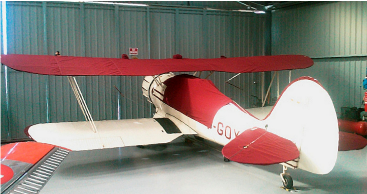
Waco UPF-7 Upper/Lower Wing Cover, Horizontal Stabilizer Cover, & Canopy Cover