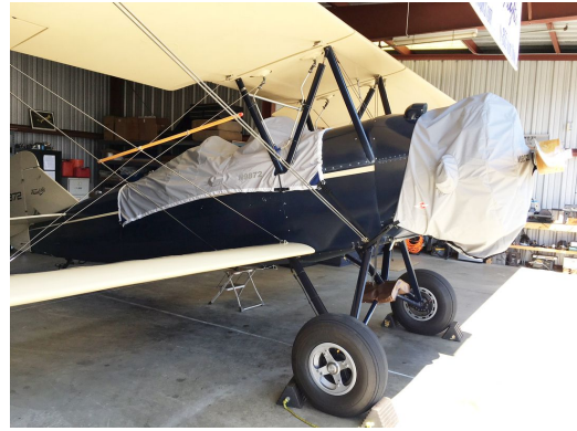
SKYBOLT, Insulated Hangar Blanket, Custom Fit Interior Use) Travel Air 4000 Canopy and Engine Covers, light weight travel type