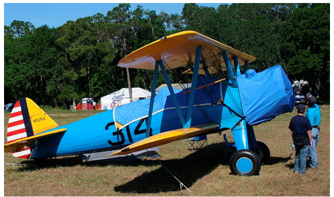
Stearman Canopy & Engine Covers