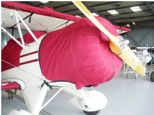
Waco UPF-7 Engine Cover

The material is very reflective, and tests show that the cabin interior temperature can be reduced to near-ambient temperature on the hottest of days. It is water, ice and snow repellent, yet breathable to allow moisture to escape from between the cover and the aircraft surface.