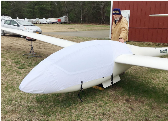
Grob 102 Astir CS Canopy/Nose Cover (test fit)

The material is very reflective, and tests show that the cabin interior temperature can be reduced to near-ambient temperature on the hottest of days. It is water, ice and snow repellent, yet breathable to allow moisture to escape from between the cover and the aircraft surface.