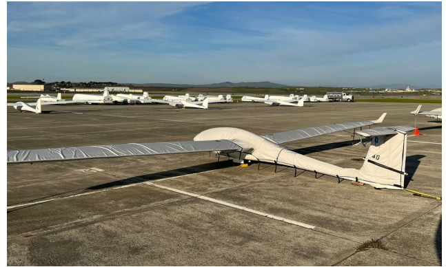
Schempp-Hirth Discus 2B Complete Cover Set