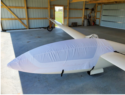
Schempp-Hirth Ventus B Canopy/Nose Cover, test fit cover

The material is very reflective, and tests show that the cabin interior temperature can be reduced to near-ambient temperature on the hottest of days. It is water, ice and snow repellent, yet breathable to allow moisture to escape from between the cover and the aircraft surface.