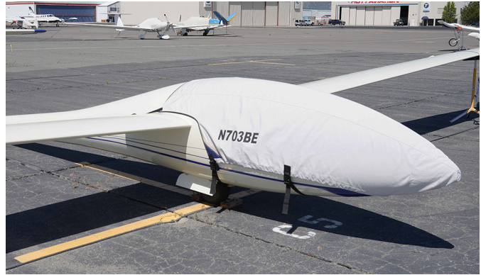
Schempp-Hirth Ventus C Canopy/Nose Cover