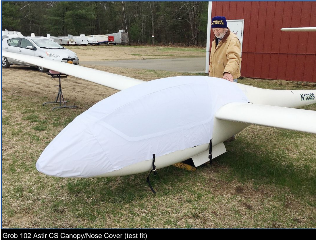
Grob 102 Astir CS Canopy/Nose Cover (test fit)