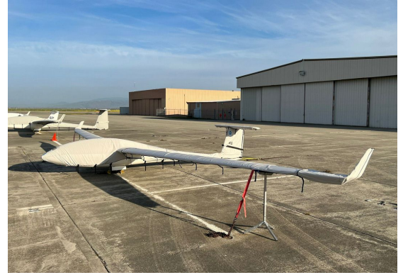
Schempp-Hirth Discus 2B Complete Cover Set