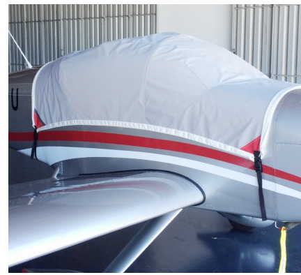
Vans's RV-9 Light Weight Travel Canopy Cover