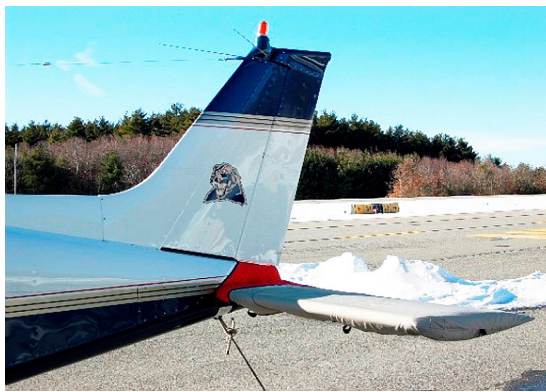
Tailcone & Horizontal Stabilizer Covers