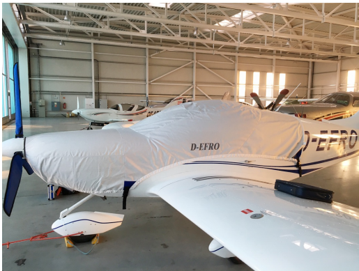
SportCruiser Canopy/Engine Cover