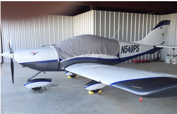
PiperSport Light Weight Travel Cover

This cover type is made from Silver Acrylic Sunbrella canvas and is 100% lined with a soft and smooth microfiber. Bruce's Custom Covers developed this material combination especially for aircraft protection. The outer material is medium weight and treated for water resistance, UV resistance and anti-static buildup. The inner lining is a very soft and smooth microfiber to prevent scratching. The material is very reflective, and tests show that the cabin interior temperature can be reduced to near-ambient temperature on the hottest of days. It is water, ice and snow repellent, yet breathable to allow moisture to escape from between the cover and the aircraft surface.