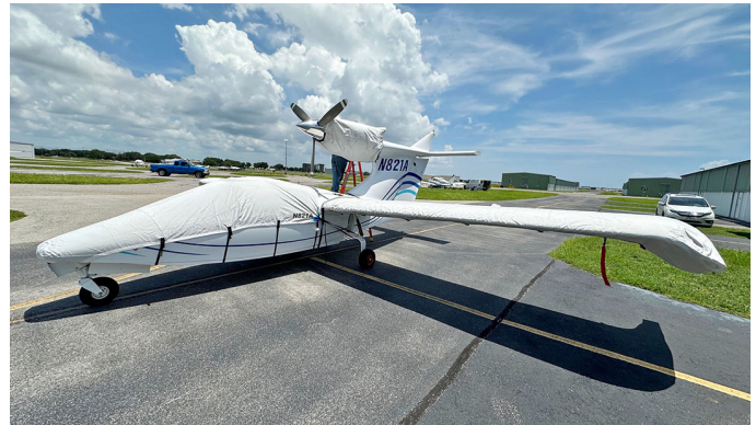
Seawind 3000 Canopy/Nose, Wing & Engine Covers