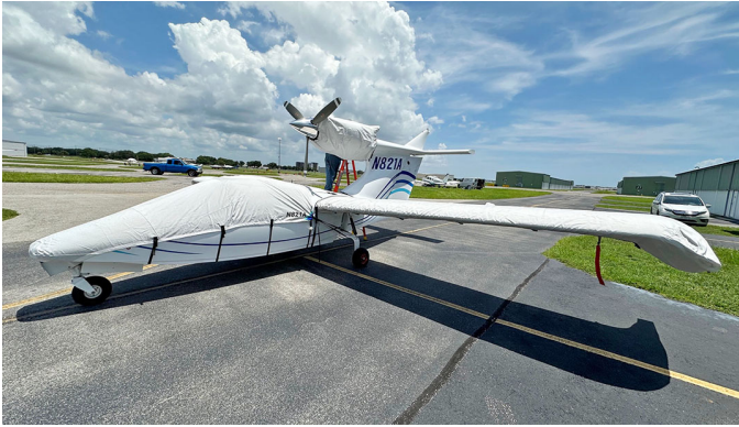
Seawind 3000 Canopy/Nose, Wing & Engine Covers

This cover type is made from Silver Acrylic Sunbrella canvas and is 100% lined with a soft and smooth microfiber. Bruce's Custom Covers developed this material combination especially for aircraft protection. The outer material is medium weight and treated for water resistance, UV resistance and anti-static buildup. The inner lining is a very soft and smooth microfiber to prevent scratching. The material is very reflective, and tests show that the cabin interior temperature can be reduced to near-ambient temperature on the hottest of days. It is water, ice and snow repellent, yet breathable to allow moisture to escape from between the cover and the aircraft surface.