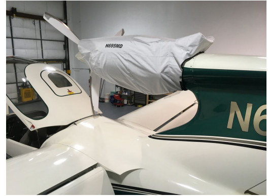
Seawind 3000 Custom Engine Cover