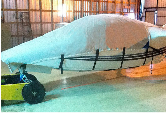
Seawind Canopy/Nose Cover

This cover type is made from Silver Acrylic Sunbrella canvas and is 100% lined with a soft and smooth microfiber. Bruce's Custom Covers developed this material combination especially for aircraft protection. The outer material is medium weight and treated for water resistance, UV resistance and anti-static buildup. The inner lining is a very soft and smooth microfiber to prevent scratching. The material is very reflective, and tests show that the cabin interior temperature can be reduced to near-ambient temperature on the hottest of days. It is water, ice and snow repellent, yet breathable to allow moisture to escape from between the cover and the aircraft surface.