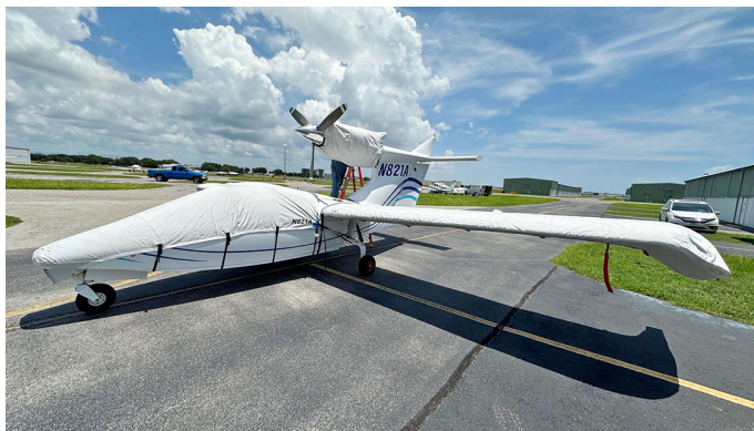
Seawind 3000 Canopy/Nose, Wing & Engine Covers

This cover type is made from Silver Acrylic Sunbrella canvas and is 100% lined with a soft and smooth microfiber. Bruce's Custom Covers developed this material combination especially for aircraft protection. The outer material is medium weight and treated for water resistance, UV resistance and anti-static buildup. The inner lining is a very soft and smooth microfiber to prevent scratching. The material is very reflective, and tests show that the cabin interior temperature can be reduced to near-ambient temperature on the hottest of days. It is water, ice and snow repellent, yet breathable to allow moisture to escape from between the cover and the aircraft surface.