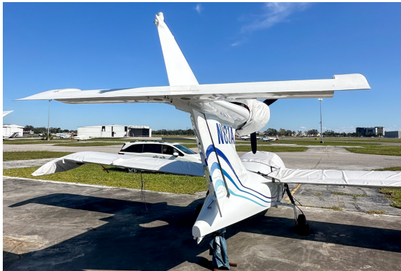
Seawind Seawind 300C & 3000 Amphibian Wing Covers, All Year Use

This cover type is made from Silver Acrylic Sunbrella canvas and is 100% lined with a soft and smooth microfiber. Bruce's Custom Covers developed this material combination especially for aircraft protection. The outer material is medium weight and treated for water resistance, UV resistance and anti-static buildup. The inner lining is a very soft and smooth microfiber to prevent scratching. The material is very reflective, and tests show that the cabin interior temperature can be reduced to near-ambient temperature on the hottest of days. It is water, ice and snow repellent, yet breathable to allow moisture to escape from between the cover and the aircraft surface.