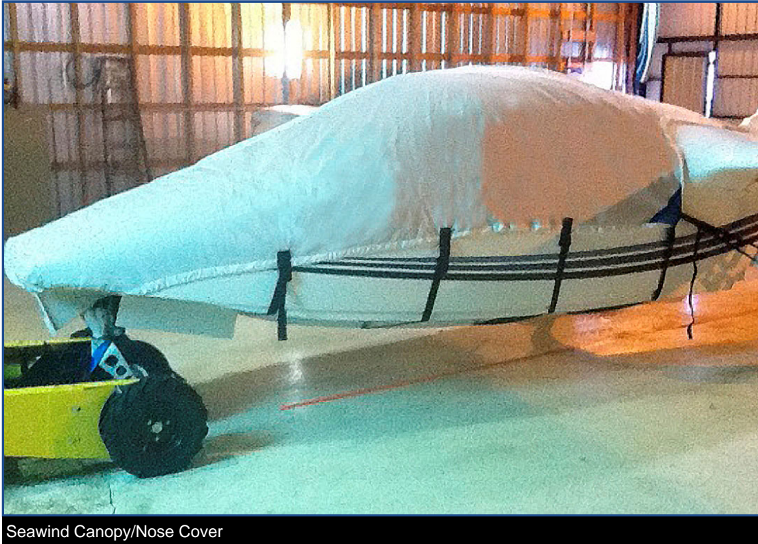
Seawind Canopy/Nose Cover