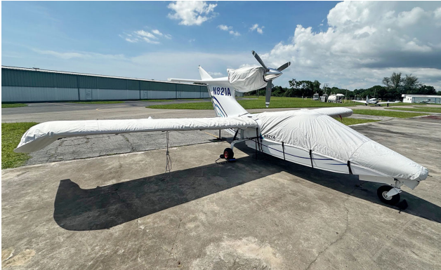
Seawind 3000 Canopy/Nose, Wing & Engine Covers

WINTER USE MATERIAL - Made with Solution-Dyed Polyester fabric, this option is intended for seasonal use to aid in deicing, rain mitigation, or for occasional travel. The material is lighter and more compact, but more susceptible to UV damage and may have a shorter useful life if used continuously outside than the all-year use material.