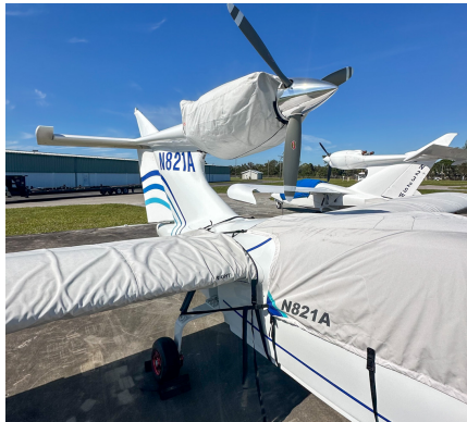
Seawind Seawind 300C & 3000 Amphibian Wing Covers, All Year Use