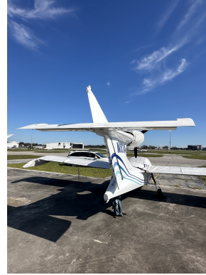
Seawind Seawind 300C & 3000 Amphibian Wing Covers, All Year Use