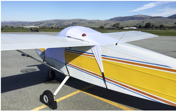
Bolkow Junior 208 Canopy Cover (test fit)