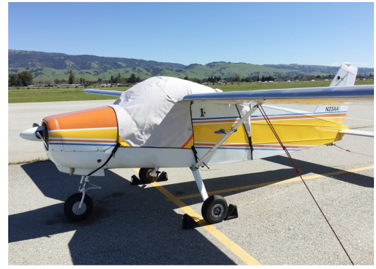
Bolkow Junior 208 Canopy Cover