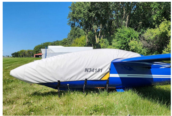
Schweizer SGS 1-35 Canopy/Nose Cover