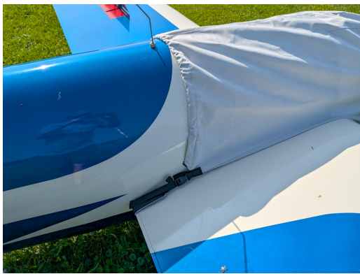
Schweizer 1-23H-15 Canopy/Nose Cover