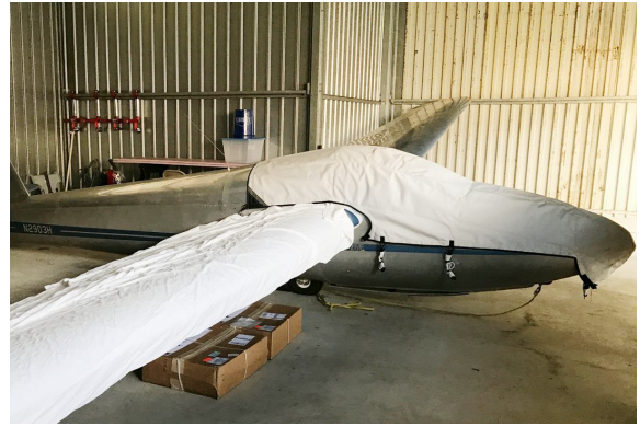
Schweizer SGS 1-26E Canopy/Nose Cover