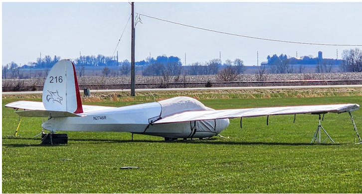
Schweizer 1-26 Canopy/Nose Cover, Wing Covers

the hottest of days. It is water, ice and snow repellent, yet breathable to allow moisture to escape from between the cover and the aircraft surface.