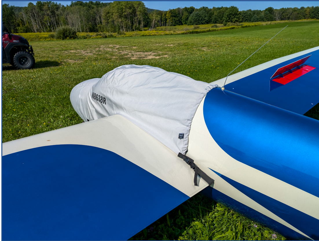
Schweizer 1-23H-15 Canopy/Nose Cover