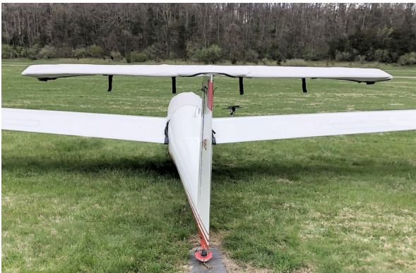
Schweizer 1-36 Canopy & Horiz. Stab. Covers

WINTER USE MATERIAL - Made with Solution-Dyed Polyester fabric, this option is intended for seasonal use to aid in deicing, rain mitigation, or for occasional travel. The material is lighter and more compact, but more susceptible to UV damage and may have a shorter useful life if used continuously outside than the all-year use material.