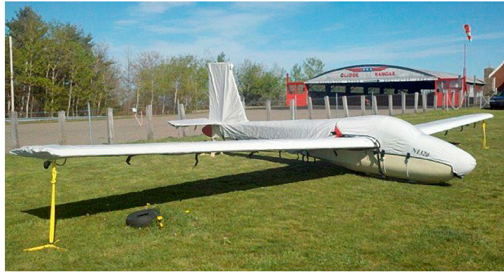
Schweizer 1-26B Canopy/Nose, Empennage & Wing Covers