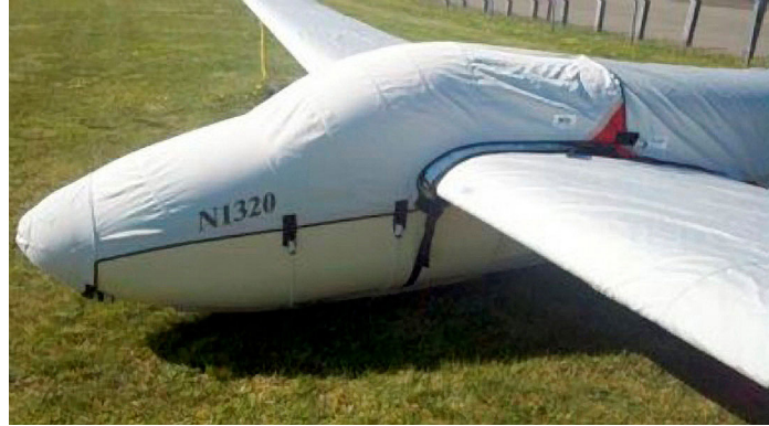
Schweizer SGS 1-26B Canopy/Nose, Wings & Empennage Covers