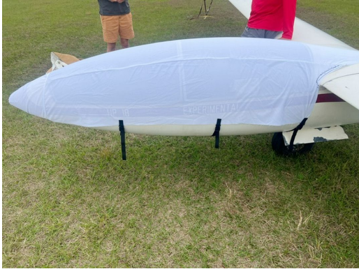
Schreder HP-18 Canopy/Nose Cover

The material is very reflective, and tests show that the cabin interior temperature can be reduced to near-ambient temperature on the hottest of days. It is water, ice and snow repellent, yet breathable to allow moisture to escape from between the cover and the aircraft surface.