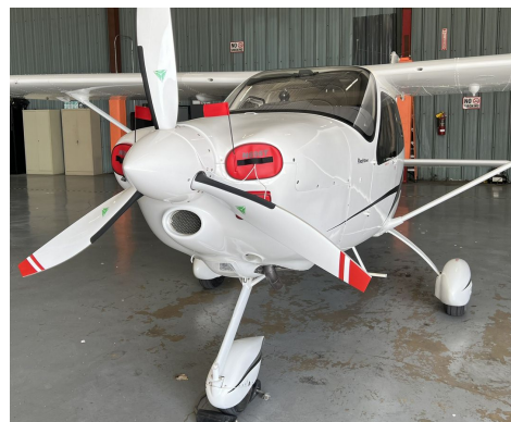
Tecnam P2010 Engine Plugs