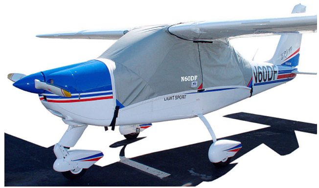
Tecnam Bravo Canopy Cover