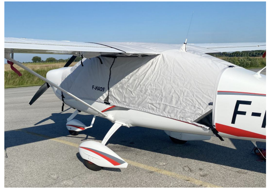
Tecnam P2010 Over-Top Canopy Cover