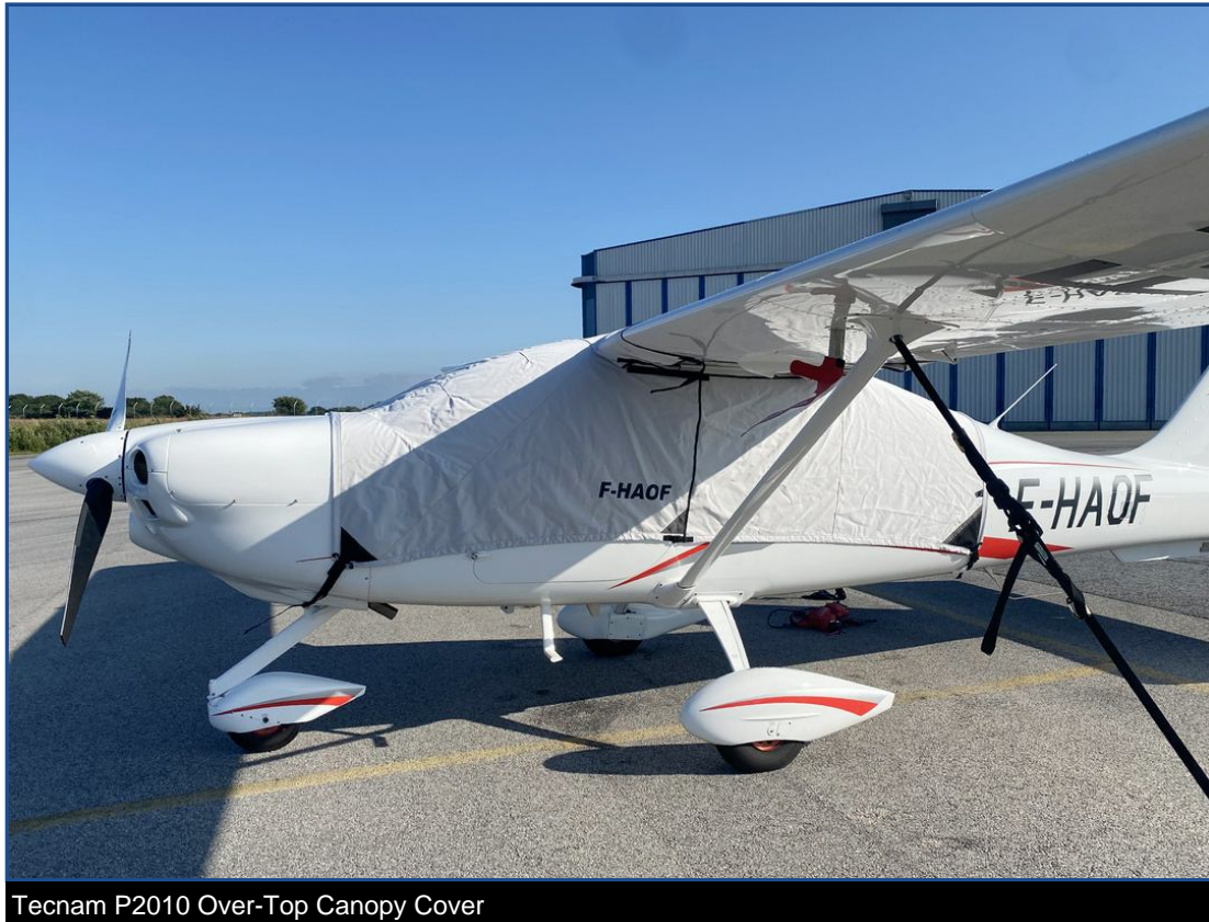
Tecnam P2010 Over-Top Canopy Cover