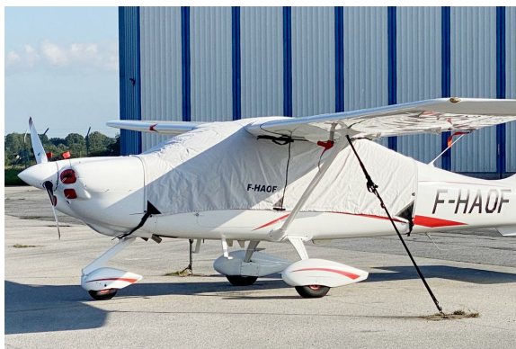
Tecnam P2010 Over-Top Canopy Cover, Engine Plugs

Engine Inlet Plugs are custom fit for your Airplane Factory Sling HW intakes, made with heavy-duty vinyl material, and stuffed with a single block of sculpted urethane foam. Each plug has a zipper that allows the foam to be removed and dried if necessary. Engine plugs have warning flags that are visible from the cockpit or 'remove before flight' streamers sewn onto the face of the plugs. Most plugs are imprinted with the aircraft registration number in black for an extra charge. Storage bag NOT included. Engine plugs may be inserted after flight when the engine is still warm. Engine Inlet Plugs are commonly referred to as Cowl Plugs, Intake Plugs, Cowl Blocks, Engine Blocks, and Engine Bungs.