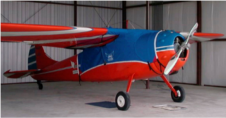
Cessna 195 Canopy Cover, over-top, 24" fwd ext to cover cowl ring gap, gas cap ext. Cessna 195 Canopy Cover, extended forward and over gas caps