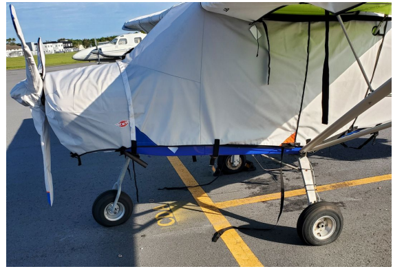
Best Off Skyranger Complete Cover Set