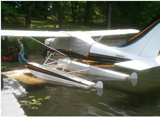
Glstar Sportsman Canopy Cover