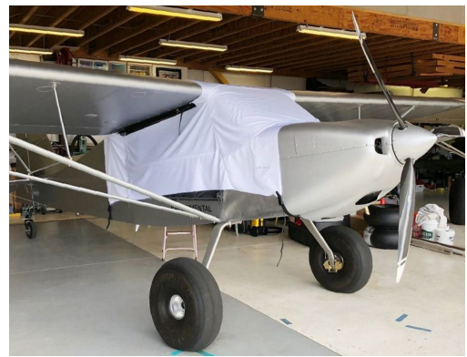
Rans S-20 Canopy Cover, test fit cover