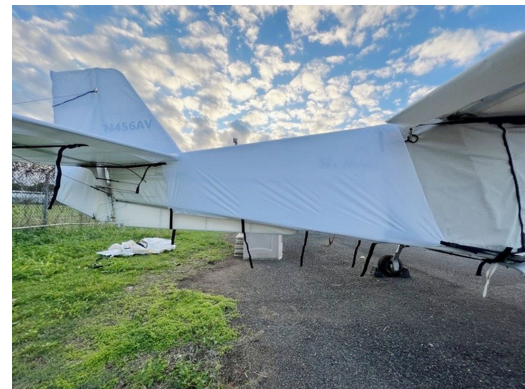
Best Off Skyranger Empennage Cover, test fit cover