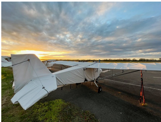
Best Off Skyranger Canopy, Wing & Empennage Covers

WINTER USE MATERIAL - Made with Solution-Dyed Polyester fabric, this option is intended for seasonal use to aid in deicing, rain mitigation, or for occasional travel. The material is lighter and more compact, but more susceptible to UV damage and may have a shorter useful life if used continuously outside than the all-year use material.