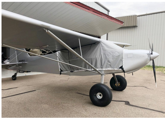
RANS S20 TRAVEL COVER