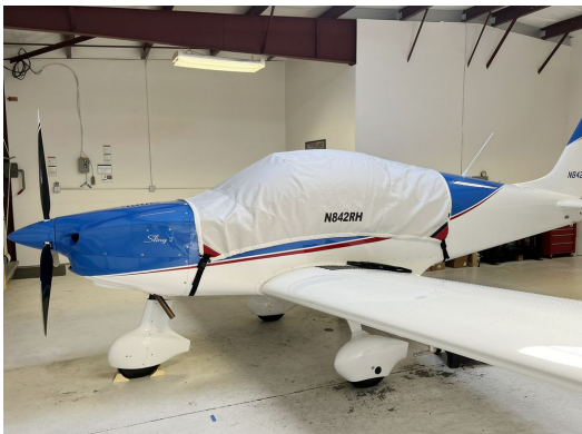
Airplane Factory Sling 2 Canopy Cover

This cover type is made from Silver Acrylic Sunbrella canvas and is 100% lined with a soft and smooth microfiber. Bruce's Custom Covers developed this material combination especially for aircraft protection. The outer material is medium weight and treated for water resistance, UV resistance and anti-static buildup. The inner lining is a very soft and smooth microfiber to prevent scratching. The material is very reflective, and tests show that the cabin interior temperature can be reduced to near-ambient temperature on the hottest of days. It is water, ice and snow repellent, yet breathable to allow moisture to escape from between the cover and the aircraft surface.