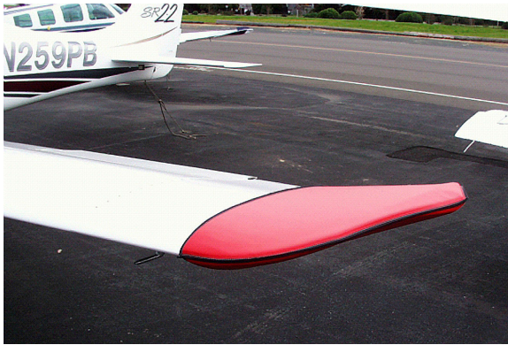
Cirrus SR-22 Wingtip Pad (also available for the Horiz. Stab.

Designed to prevent damage to the aircraft extremities in crowded hangars, these products are made of bright red Naugahyde and thickly padded with a sandwich of closed cell foam.