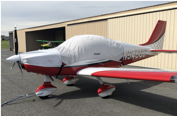
Airplane Factory Sling 2 Canopy Cover