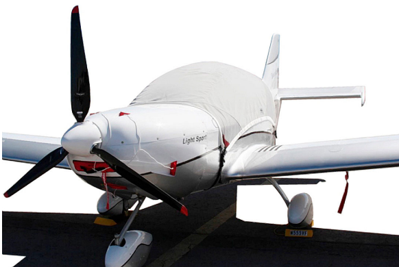
Sportcruiser Canopy Cover & Plugs

Travel Covers are made with Silver Solution-Dyed Polyester fabric and only lined over the windshield to save weight. The material is lightweight and more compact for easy stowage in the aircraft. The polyester material is water resistant, but only intended for occasional use outside. We also have an ultra lightweight material available for fitted hangar dust covers. For daily outdoor use, the non-travel Sunbrella Cover is the best choice.