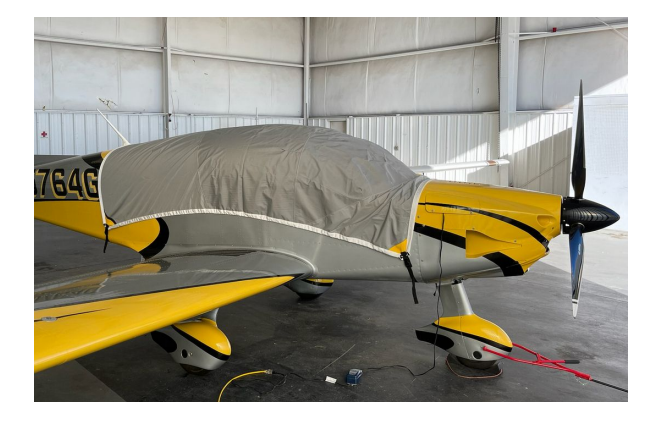
Sling TSI Travel Weight Canopy Cover

Travel Covers are made with Silver Solution-Dyed Polyester fabric and only lined over the windshield to save weight. The material is lightweight and more compact for easy stowage in the aircraft. The polyester material is water resistant, but only intended for occasional use outside. We also have an ultra lightweight material available for fitted hangar dust covers. For daily outdoor use, the non-travel Sunbrella Cover is the best choice.