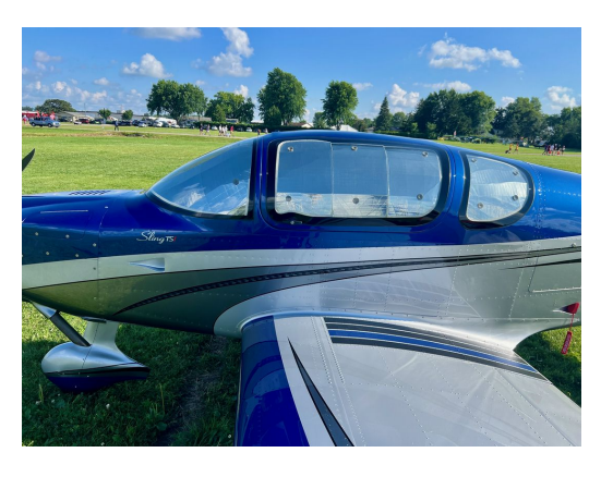
Airplane Factory Sling TSi HeatShield Set