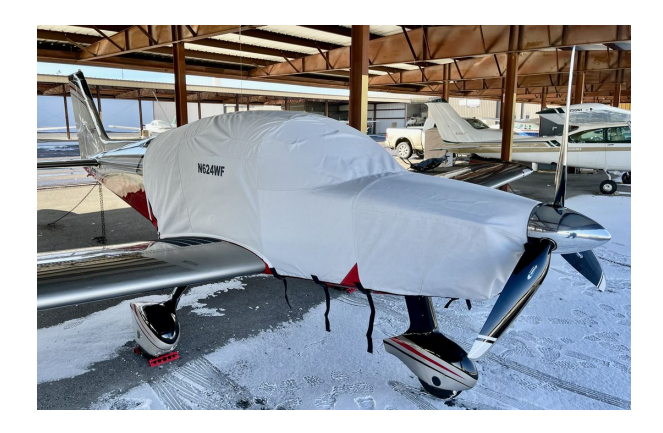
Airplane Factory Sling TSI Extended Canopy/Engine Cover

This cover type is made from Silver Acrylic Sunbrella canvas and is 100% lined with a soft and smooth microfiber. Bruce's Custom Covers developed this material combination especially for aircraft protection. The outer material is medium weight and treated for water resistance, UV resistance and anti-static buildup. The inner lining is a very soft and smooth microfiber to prevent scratching. The material is very reflective, and tests show that the cabin interior temperature can be reduced to near-ambient temperature on the hottest of days. It is water, ice and snow repellent, yet breathable to allow moisture to escape from between the cover and the aircraft surface.