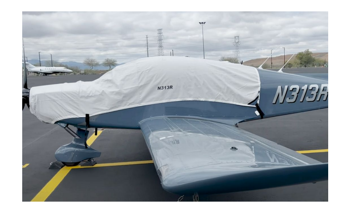
Sling 4 TSi Canopy/Engine Cover