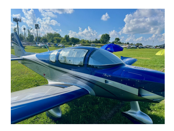
Airplane Factory Sling TSi HeatShield Set