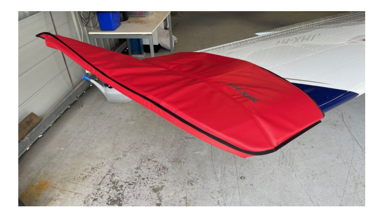
Sling TSI Wingtip Pads