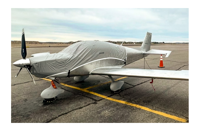
Sling TSi Travel Weight Canopy/Engine Cover