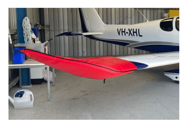
Sling TSI Wingtip Pads

Designed to prevent damage to the aircraft extremities in crowded hangars, these products are made of bright red Naugahyde and thickly padded with a sandwich of closed cell foam.