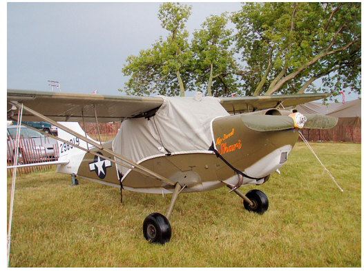
Stinson L-5 Canopy Cover