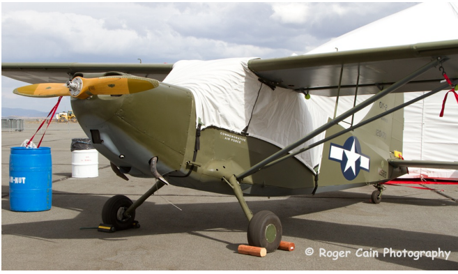
Stinson L-5 Canopy Cover