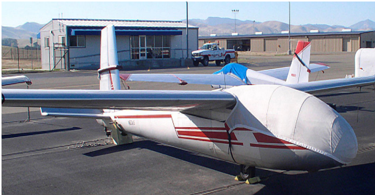
Blanik L13 Canopy/Nose Cover