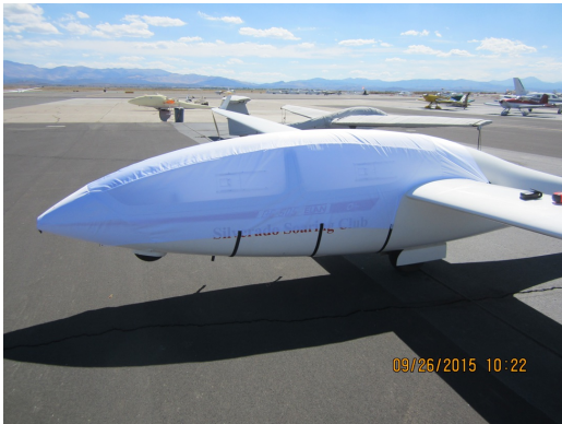
DG-505 Canopy/Nose Cover (test fit cover)