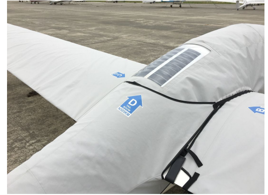
DG-505 Full Cover Set