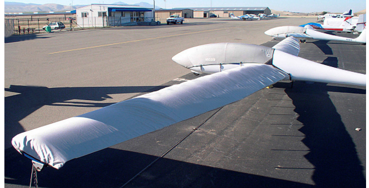
Sailplane Full Cover Set Graphic Indicators (Discus 2B, 3D model)