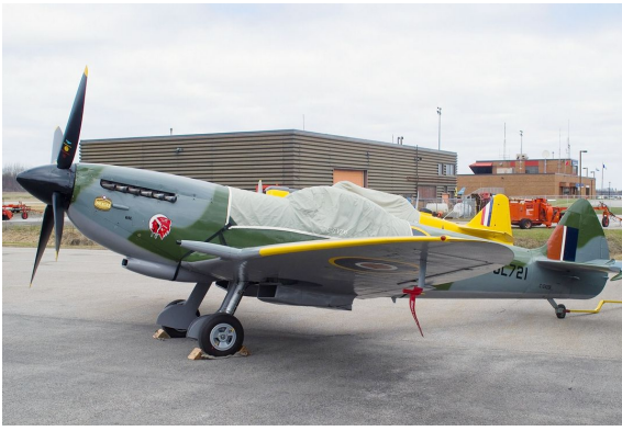
Supermarine Spitfire Mk 14 Canopy Cover