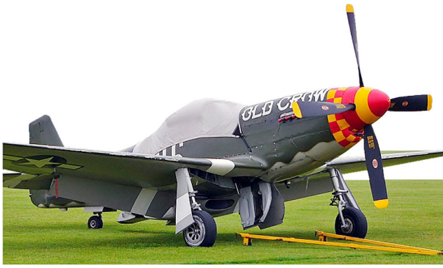
Canopy Cover, Chin Scoop & Exhaust Plugs