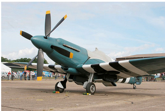
Supermarine Spitfire XIX Canopy Cover

Travel Covers are made with Silver Solution-Dyed Polyester fabric and only lined over the windshield to save weight. The material is lightweight and more compact for easy stowage in the aircraft. The polyester material is water resistant, but only intended for occasional use outside. We also have an ultra lightweight material available for fitted hangar dust covers. For daily outdoor use, the non-travel Sunbrella Cover is the best choice.