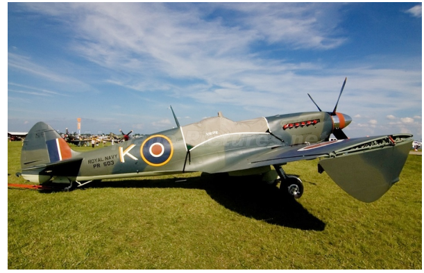
Supermarine Spitfire Mk IX Canopy Cover