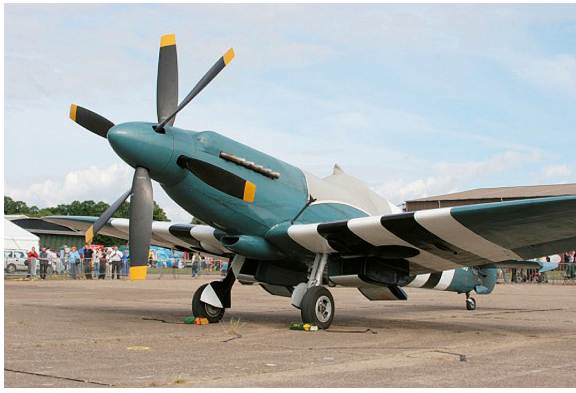
Supermarine Spitfire XIX Canopy Cover