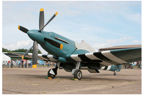
Supermarine Spitfire XIX Canopy Cover