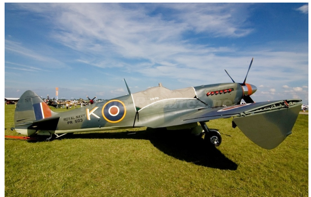
Supermarine Spitfire Mk IX Canopy Cover