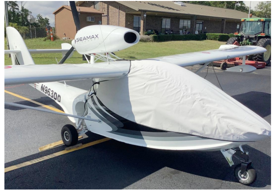
Seamax Canopy/Nose Cover