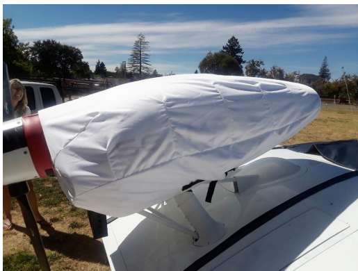
Seamax M22 Engine Cover, test fit cover

Engine Covers will cinch around or behind the spinner, cover the entire engine cowl area including the engine air cooling and induction air inlets, and fastens together with Velcro beneath the spinner down the front of the cowling. The Engine Cover is attached with a belly strap aft of the firewall, and can Velcro to the Canopy Cover. Engine Covers are normally made from Solution-Dyed Polyester or Acrylic Sunbrella . An Insulated version of the engine cover can be made with a thicker, quilted, and water-repellent material. The Insulated Engine Cover works well in cold climates to help with engine preheating.