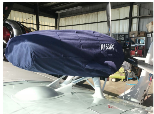
Seamax M22 Engine Cover