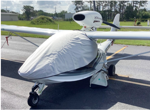
Seamax Canopy/Nose Cover

The material is very reflective, and tests show that the cabin interior temperature can be reduced to near-ambient temperature on the hottest of days. It is water, ice and snow repellent, yet breathable to allow moisture to escape from between the cover and the aircraft surface.