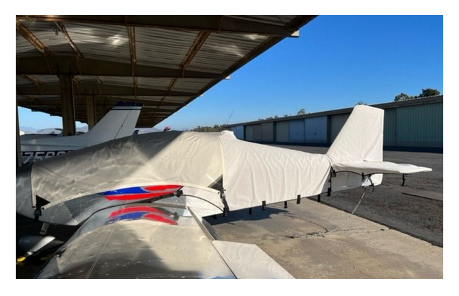
Sonex Empennage Cover, & Canopy Cover

WINTER USE MATERIAL - Made with Solution-Dyed Polyester fabric, this option is intended for seasonal use to aid in deicing, rain mitigation, or for occasional travel. The material is lighter and more compact, but more susceptible to UV damage and may have a shorter useful life if used continuously outside than the all-year use material.