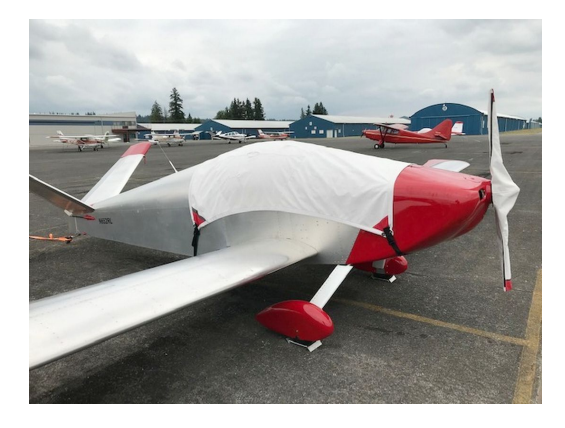
Sonex Xenos Canopy & Prop Cover

This cover type is made from Silver Acrylic Sunbrella canvas and is 100% lined with a soft and smooth microfiber. Bruce's Custom Covers developed this material combination especially for aircraft protection. The outer material is medium weight and treated for water resistance, UV resistance and anti-static buildup. The inner lining is a very soft and smooth microfiber to prevent scratching. The material is very reflective, and tests show that the cabin interior temperature can be reduced to near-ambient temperature on the hottest of days. It is water, ice and snow repellent, yet breathable to allow moisture to escape from between the cover and the aircraft surface.