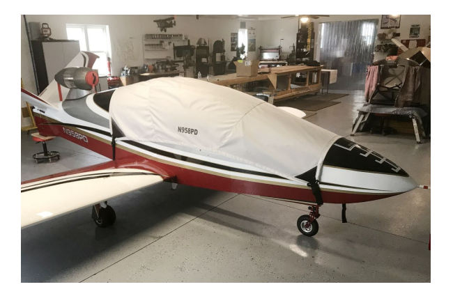
Subsonex Canopy Cover

This cover type is made from Silver Acrylic Sunbrella canvas and is 100% lined with a soft and smooth microfiber. Bruce's Custom Covers developed this material combination especially for aircraft protection. The outer material is medium weight and treated for water resistance, UV resistance and anti-static buildup. The inner lining is a very soft and smooth microfiber to prevent scratching. The material is very reflective, and tests show that the cabin interior temperature can be reduced to near-ambient temperature on the hottest of days. It is water, ice and snow repellent, yet breathable to allow moisture to escape from between the cover and the aircraft surface.