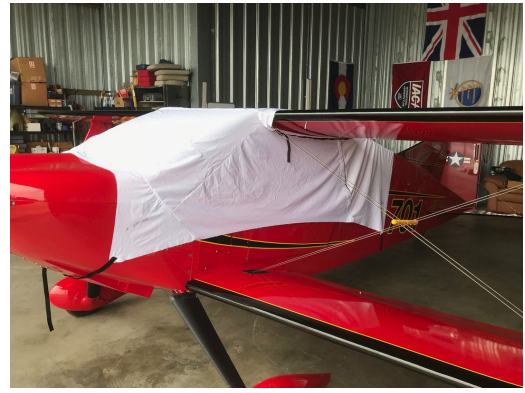
Sorrell Hiperbipe Canopy Cover (test fit cover)