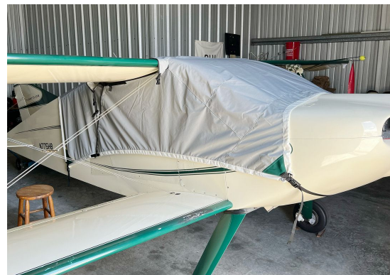
Sorrell SNS-7 Hiperbipe Over The Top Travel Canopy Cover