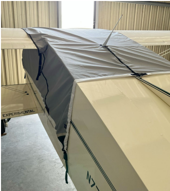
Sorrell SNS-7 Hiperbipe Over The Top Travel Canopy Cover