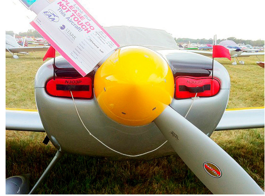
Vans's RV-7 Engine Engine Inlet Plugs