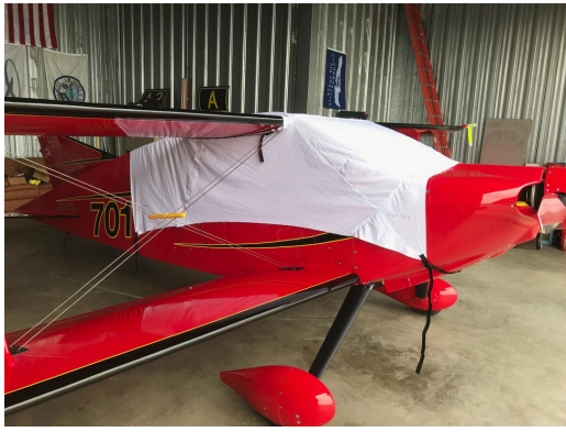
Sorrell Hiperbipe Canopy Cover (test fit cover)