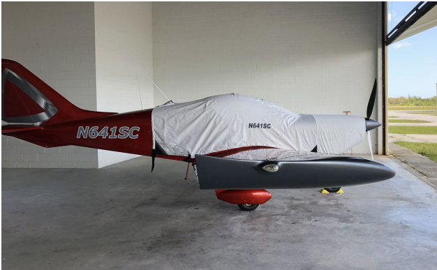
Czech Aircraft Sport Cruiser Extended Canopy/Engine Cover

This cover type is made from Silver Acrylic Sunbrella canvas and is 100% lined with a soft and smooth microfiber. Bruce's Custom Covers developed this material combination especially for aircraft protection. The outer material is medium weight and treated for water resistance, UV resistance and anti-static buildup. The inner lining is a very soft and smooth microfiber to prevent scratching. The material is very reflective, and tests show that the cabin interior temperature can be reduced to near-ambient temperature on the hottest of days. It is water, ice and snow repellent, yet breathable to allow moisture to escape from between the cover and the aircraft surface.