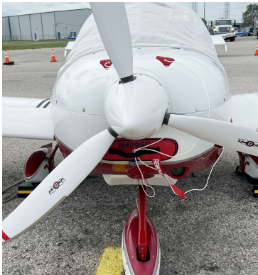
SportCruiser Engine Inlet Plugs

Engine Inlet Plugs are custom fit for your Czech Aircraft Works SportCruiser intakes, made with heavy-duty vinyl material, and stuffed with a single block of sculpted urethane foam. Each plug has a zipper that allows the foam to be removed and dried if necessary. Engine plugs have warning flags that are visible from the cockpit or 'remove before flight' streamers sewn onto the face of the plugs. Most plugs are imprinted with the aircraft registration number in black for an extra charge. Storage bag NOT included. Engine plugs may be inserted after flight when the engine is still warm. Engine Inlet Plugs are commonly referred to as Cowl Plugs, Intake Plugs, Cowl Blocks, Engine Blocks, and Engine Bungs.