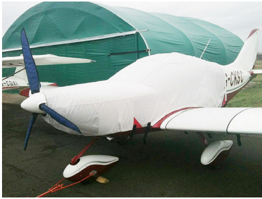
PiperSport Canopy/Engine Cover, Wing Locker Covers