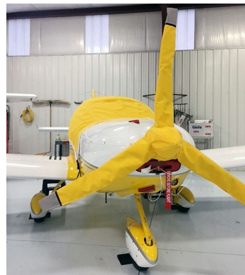
Custom Yellow Canopy Cover, Prop/Spinner, and Inlet Plugs