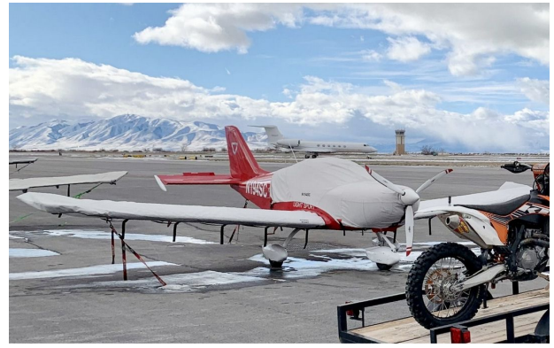
SportCruiser Canopy/Engine & Wing Covers