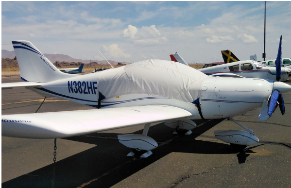
Czech Aircraft Works Sport Cruiser