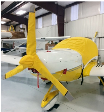
Custom Yellow Canopy Cover, Prop/Spinner, and Inlet Plugs

Engine Inlet Plugs are custom fit for your Czech Aircraft Works SportCruiser intakes, made with heavy-duty vinyl material, and stuffed with a single block of sculpted urethane foam. Each plug has a zipper that allows the foam to be removed and dried if necessary. Engine plugs have warning flags that are visible from the cockpit or 'remove before flight' streamers sewn onto the face of the plugs. Most plugs are imprinted with the aircraft registration number in black for an extra charge. Storage bag NOT included. Engine plugs may be inserted after flight when the engine is still warm. Engine Inlet Plugs are commonly referred to as Cowl Plugs, Intake Plugs, Cowl Blocks, Engine Blocks, and Engine Bungs.