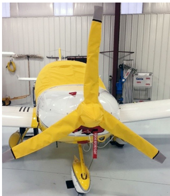
Custom Yellow Canopy Cover, Prop/Spinner, and Inlet Plugs

This cover type is made from Silver Acrylic Sunbrella canvas and is 100% lined with a soft and smooth microfiber. Bruce's Custom Covers developed this material combination especially for aircraft protection. The outer material is medium weight and treated for water resistance, UV resistance and anti-static buildup. The inner lining is a very soft and smooth microfiber to prevent scratching. The material is very reflective, and tests show that the cabin interior temperature can be reduced to near-ambient temperature on the hottest of days. It is water, ice and snow repellent, yet breathable to allow moisture to escape from between the cover and the aircraft surface.