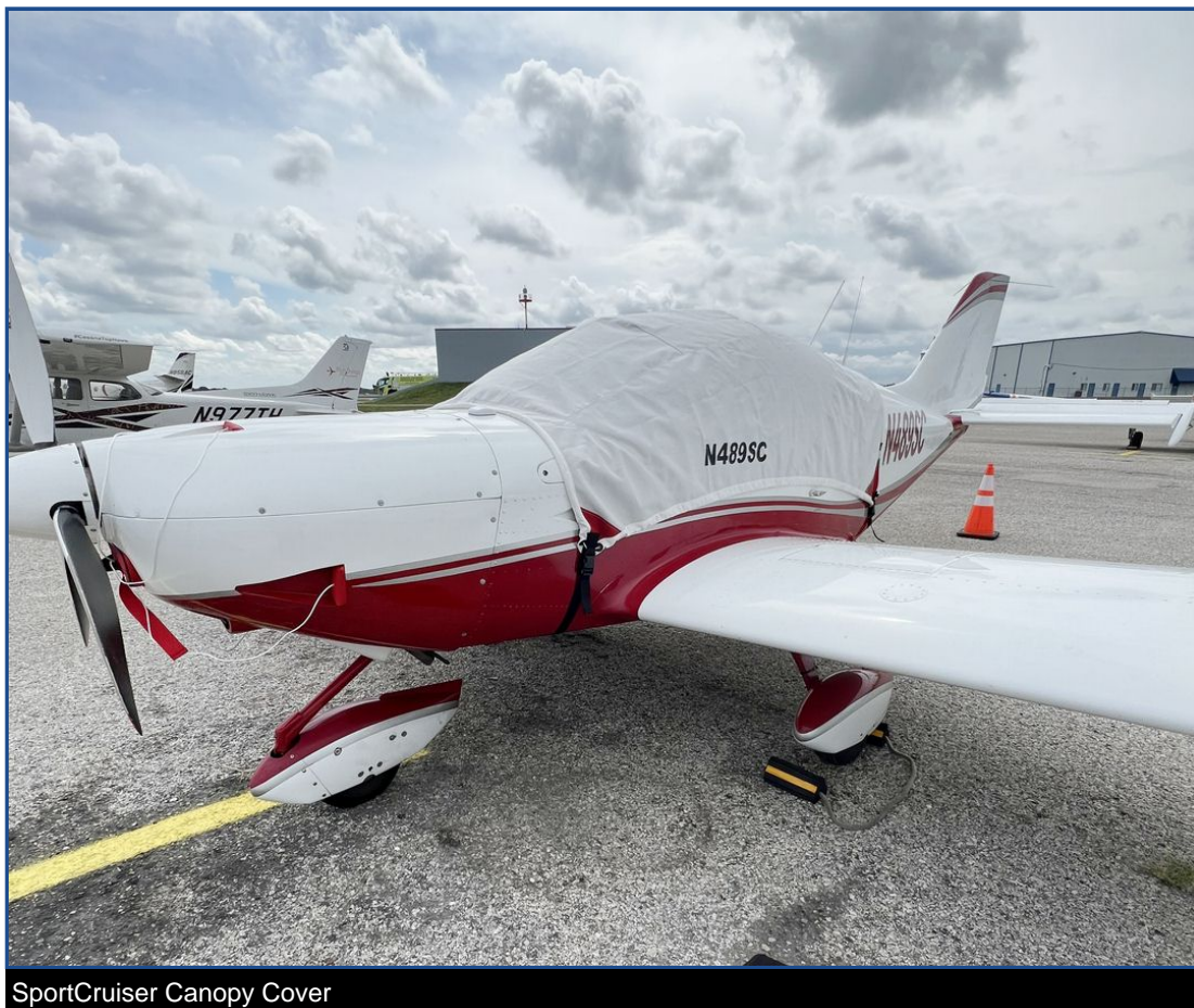
SportCruiser Canopy Cover