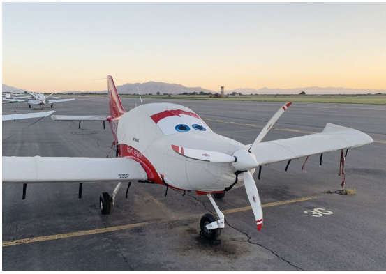
SportCruiser Canopy/Engine & Wing Covers