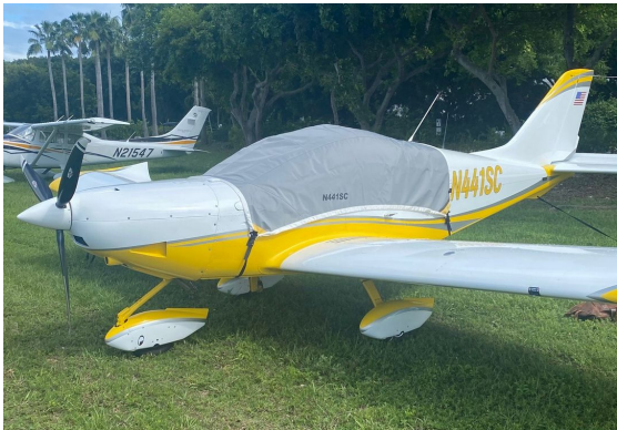
SportCruiser Travel Canopy Cover