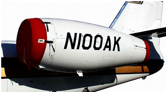
Engine Cover Set for the Astra

The Israel Aircraft Industries Astra SPX Bikini Style Engine Covers are a single-piece design using a soft and smooth stretchy fabric. The cover stretches tightly over both the intake and exhaust, installing quickly and easily. These covers are designed to be used as hangar dust covers and have a useful life of approximately one year.