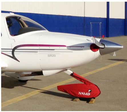
Cirrus SR20 Front Wheelpant/Strut Cover, Engine Plugs