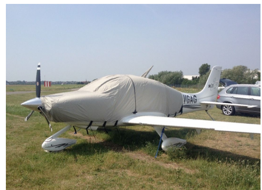
Cirrus SR-20 GTS Extended Canopy/Engine Cover