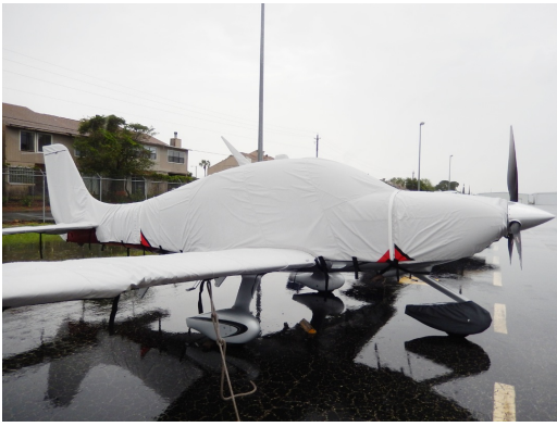
Cirrus SR-22 Complete Cover Set