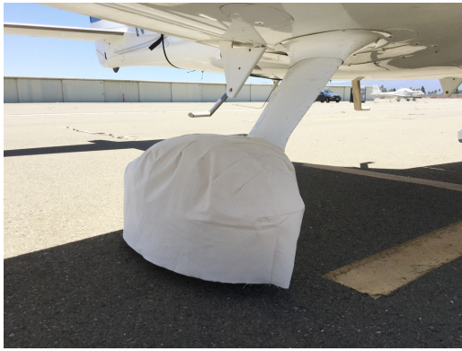
Cirrus Main Gear Wheelpant Cover