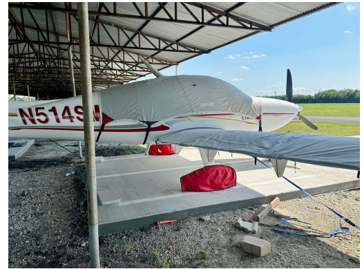
Cirrus SR-22 Canopy, Wing & Wheelpant Covers