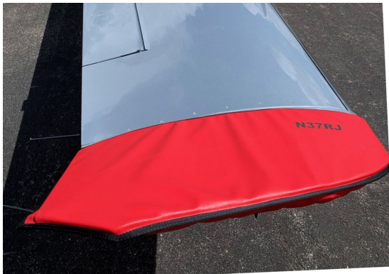
Cirrus SR-22 Wingtip Pads

Designed to prevent damage to the aircraft extremities in crowded hangars, these products are made of bright red Naugahyde and thickly padded with a sandwich of closed cell foam.