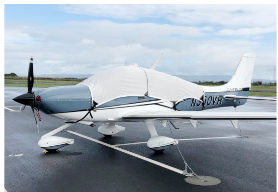
Cirrus SR22T G6 Canopy Cover (extended to cover parachute panel)