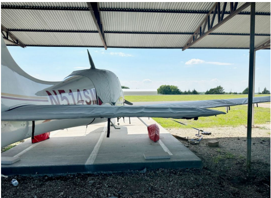
Cirrus SR-22 Canopy, Wing & Wheelpan Covers

WINTER USE MATERIAL - Made with Solution-Dyed Polyester fabric, this option is intended for seasonal use to aid in deicing, rain mitigation, or for occasional travel. The material is lighter and more compact, but more susceptible to UV damage and may have a shorter useful life if used continuously outside than the all-year use material.