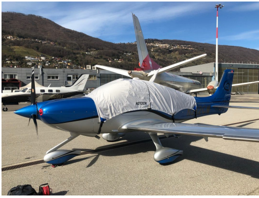
Cirrus SR-22 Canopy Cover (extends to cover parachute panel), Engine Plugs