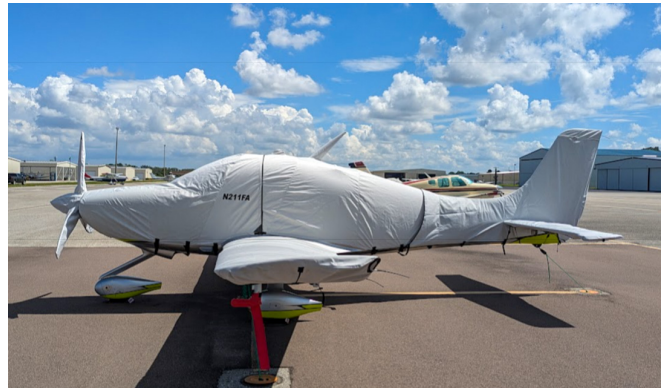
Cirrus SR-20 Complete Cover Set