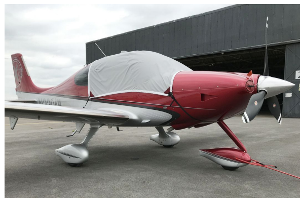
Cirrus SR-22 Cockpit Cover