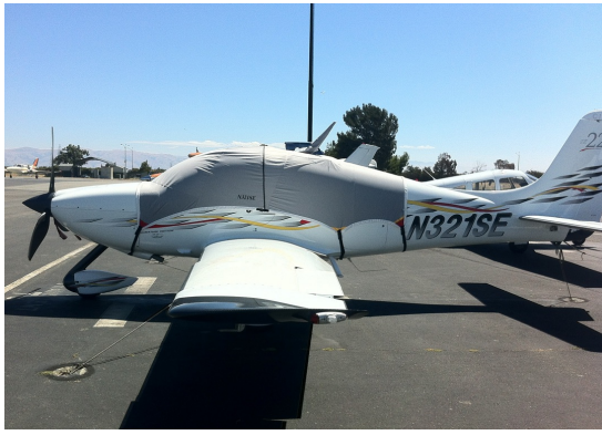
Cirrus SR-22 Light Weight Travel Cover