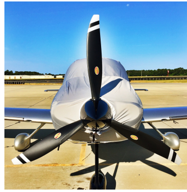
Cirrus SR22 Light Weight Travel Canopy/Engine Cover