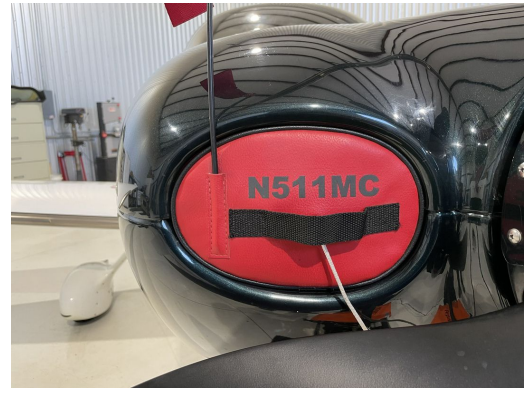
Cirrus SR22T Engine Inlet Plugs