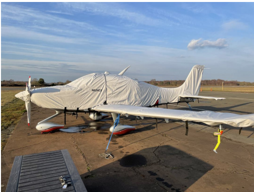
Cirrus SR-22 Complete Cover Set