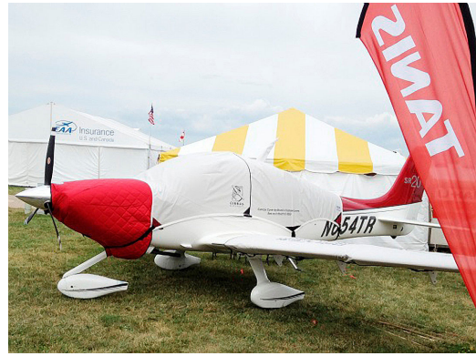
Cirrus SR22 Canopy Cover / Insulated Engine Cover / Wing Covers