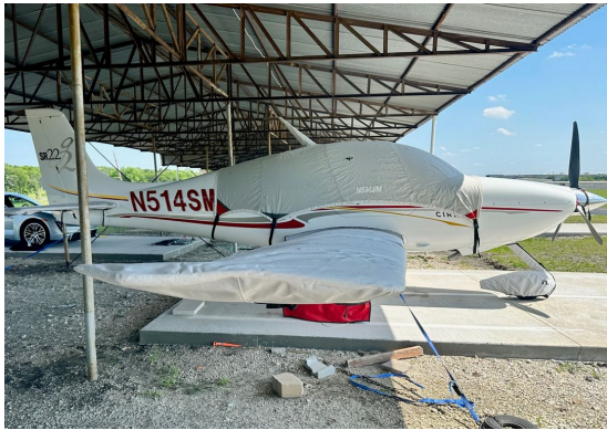
Cirrus SR-22 Canopy, Wing & Wheelpant Covers

Designed to prevent damage to the aircraft extremities in crowded hangars, these products are made of bright red Naugahyde and thickly padded with a sandwich of closed cell foam.