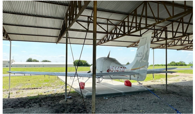
Cirrus SR-22 Canopy, Wing & Wheelpan Covers