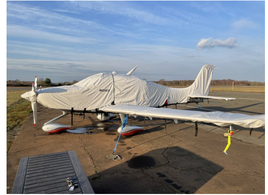
Cirrus SR-22 Complete Cover Set