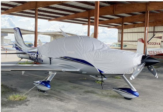
Cirrus SR22 Canopy/Engine Cover

This cover type is made from Silver Acrylic Sunbrella canvas and is 100% lined with a soft and smooth microfiber. Bruce's Custom Covers developed this material combination especially for aircraft protection. The outer material is medium weight and treated for water resistance, UV resistance and anti-static buildup. The inner lining is a very soft and smooth microfiber to prevent scratching. The material is very reflective, and tests show that the cabin interior temperature can be reduced to near-ambient temperature on the hottest of days. It is water, ice and snow repellent, yet breathable to allow moisture to escape from between the cover and the aircraft surface.