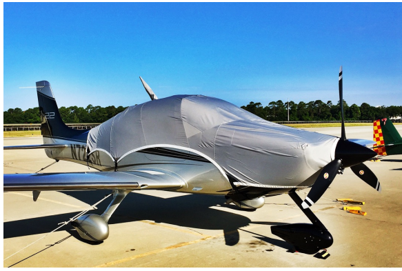
Cirrus SR22 Light Weight Travel Canopy/Engine Cover