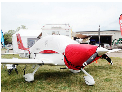
Cirrus SR22 Canopy Cover / Insulated Engine Cover / Wing Covers

This cover type is made from Silver Acrylic Sunbrella canvas and is 100% lined with a soft and smooth microfiber. Bruce's Custom Covers developed this material combination especially for aircraft protection. The outer material is medium weight and treated for water resistance, UV resistance and anti-static buildup. The inner lining is a very soft and smooth microfiber to prevent scratching. The material is very reflective, and tests show that the cabin interior temperature can be reduced to near-ambient temperature on the hottest of days. It is water, ice and snow repellent, yet breathable to allow moisture to escape from between the cover and the aircraft surface.