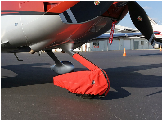
Cirrus SR22 Front Wheelpant/Strut Cover