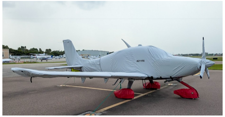
Cirrus SR-20 Complete Cover Set