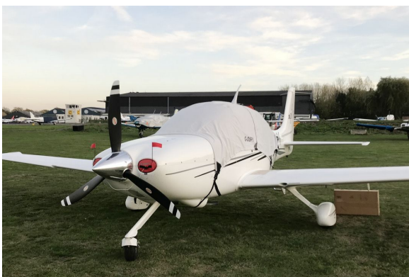
Cirrus SR20 G2 GTS Canopy Cover extended to cover parachute panel

This cover type is made from Silver Acrylic Sunbrella canvas and is 100% lined with a soft and smooth microfiber. Bruce's Custom Covers developed this material combination especially for aircraft protection. The outer material is medium weight and treated for water resistance, UV resistance and anti-static buildup. The inner lining is a very soft and smooth microfiber to prevent scratching. The material is very reflective, and tests show that the cabin interior temperature can be reduced to near-ambient temperature on the hottest of days. It is water, ice and snow repellent, yet breathable to allow moisture to escape from between the cover and the aircraft surface.