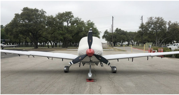
Cirrus SR-22 Canopy/Engine & Wing Covers