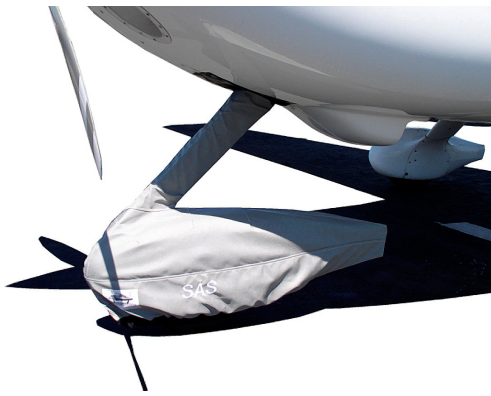
Cirrus Front Wheelpant/Strut Cover