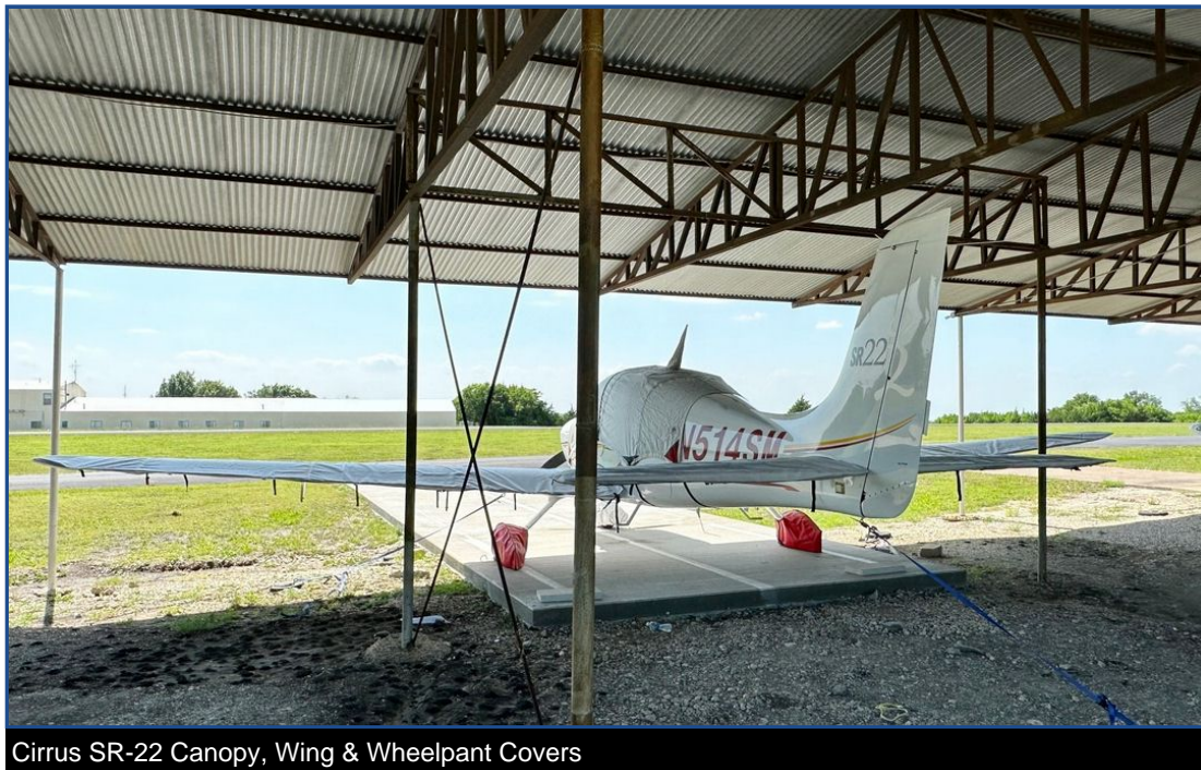
Cirrus SR-22 Canopy, Wing &amp; Wheelpant Covers