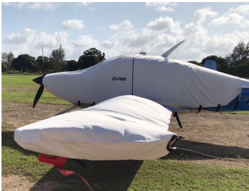
Cirrus SR-22 Extended Canopy/Engine & Wing Covers