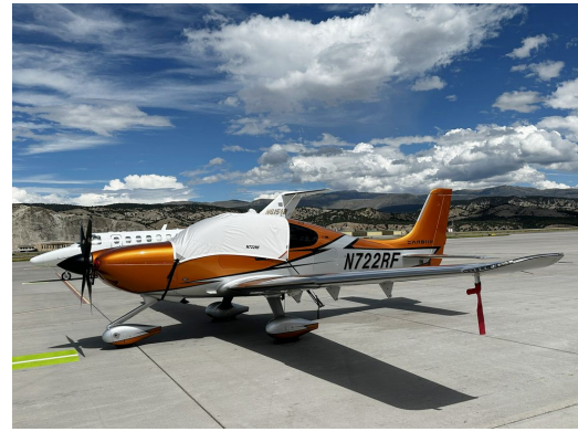
Cirrus SR22 Cockpit Cover, Windshield And Forward Side Windows