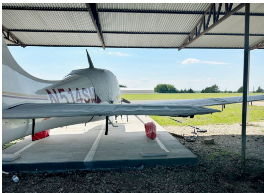
Cirrus SR-22 Canopy, Wing & Wheelpan Covers

WINTER USE MATERIAL - Made with Solution-Dyed Polyester fabric, this option is intended for seasonal use to aid in deicing, rain mitigation, or for occasional travel. The material is lighter and more compact, but more susceptible to UV damage and may have a shorter useful life if used continuously outside than the all-year use material.