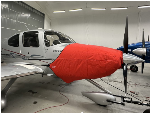
Cirrus SR-22 Insulated Engine Cover