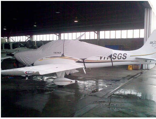
Cirrus SR22 Canopy/Engine Cover