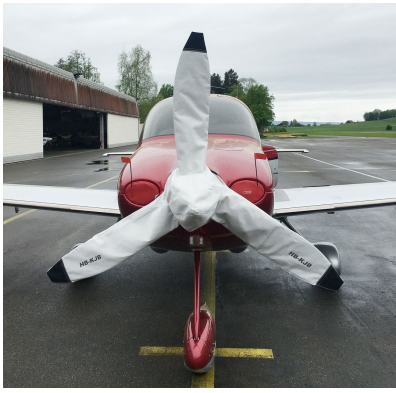
Cirrus SR22 Propellor/Spinner Cover and Inlet Plugs