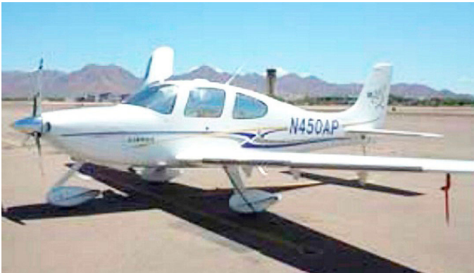
Cirrus SR20 HeatShield set