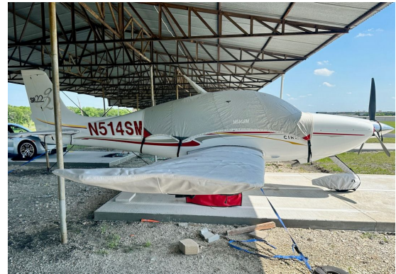
Cirrus SR-22 Canopy, Wing & Wheelpant Covers