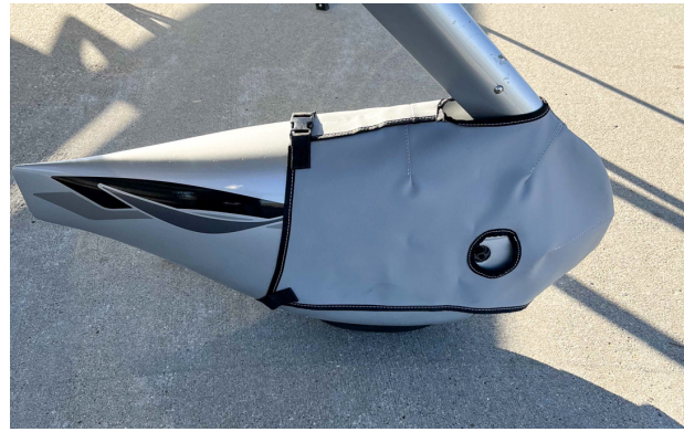
Cirrus SR22 Abbreviated Front Wheelpant (For Tow Bar Protection)