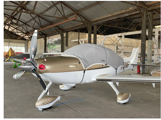
Cirrus SR-22 Travel Weight Canopy Cover