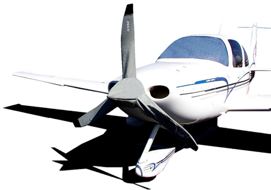
Cirrus SR-22 Propellor/Spinner Cover & Windshield Heatshield

Windshield Heatshields are interior sunshades for an aircraft's front windshield. The product is a unique composite of closed-cell foam with a silver mylar finish. The semi-rigid design is stiff enough to stand along the inside of the windshield using sun visors or window framing. It folds up flat and easily stores in the included storage sleeve. Some designs may require velcro and suction cups or split right and left sides. A Heatshield is an excellent short-term remedy for cockpit overheating. An external fabric cover is far more effective and practical for long-term protection.