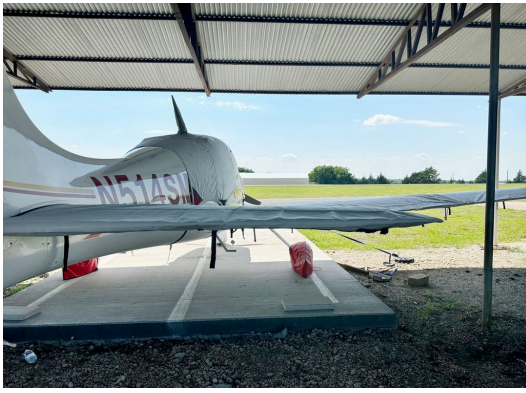
Cirrus SR-22 Canopy, Wing & Wheelpant Covers