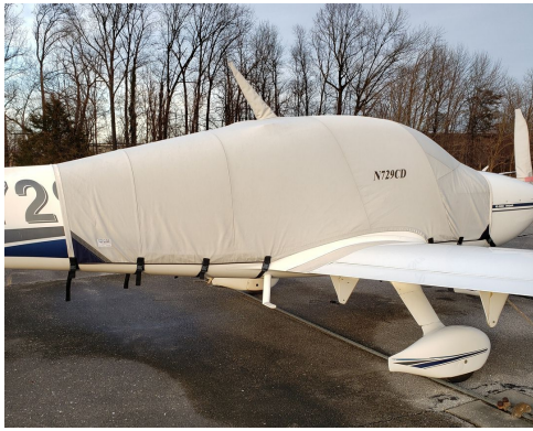
Cirrus SR-22 Extended Canopy Cover