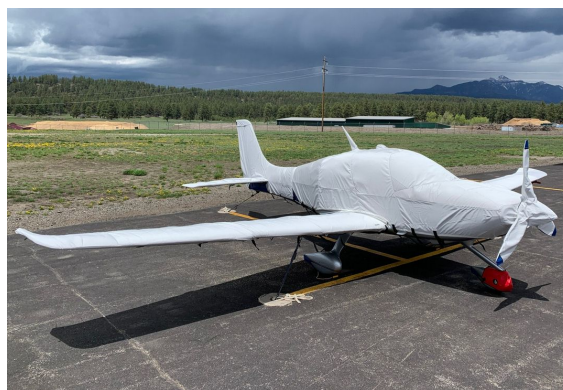
Cirrus SR22 Complete Cover Set