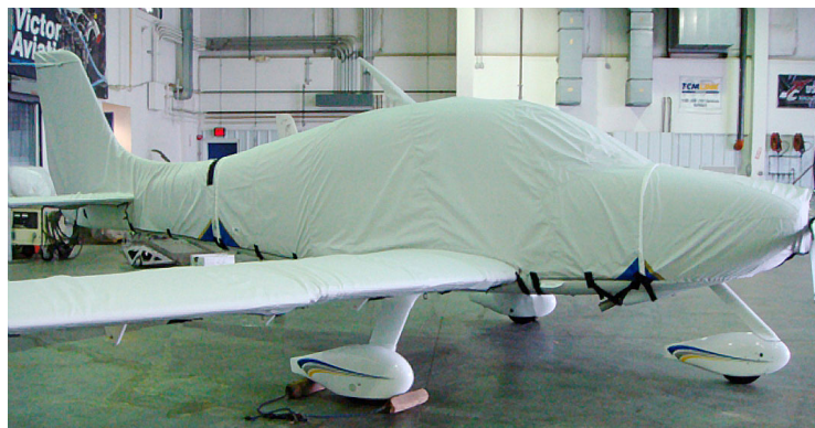
Cirrus SR20 Full Cover Set (Extended Canopy Cover, Engine Cover, Wing Covers, Empennage Cover)