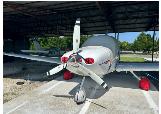
Cirrus SR-22 Wheelpant Covers