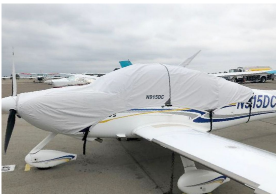
Cirrus SR22 G2 CANOPY/ENGINE COVER

This cover type is made from Silver Acrylic Sunbrella canvas and is 100% lined with a soft and smooth microfiber. Bruce's Custom Covers developed this material combination especially for aircraft protection. The outer material is medium weight and treated for water resistance, UV resistance and anti-static buildup. The inner lining is a very soft and smooth microfiber to prevent scratching. The material is very reflective, and tests show that the cabin interior temperature can be reduced to near-ambient temperature on the hottest of days. It is water, ice and snow repellent, yet breathable to allow moisture to escape from between the cover and the aircraft surface.