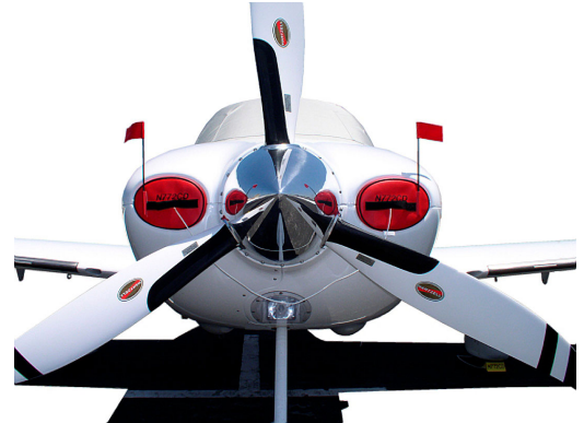
Cirrus SR22 Engine Plugs