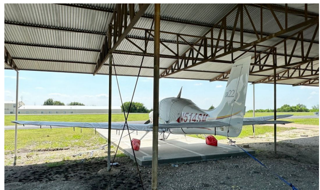
Cirrus SR-22 Canopy, Wing & Wheelpan Covers