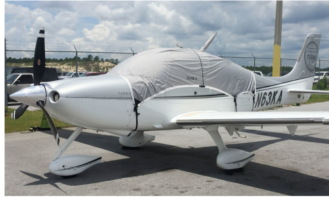
Cirrus SR22 Travel Cover, Light Weight Travel Canopy Cover (Does Not Cover Parachute Panel)