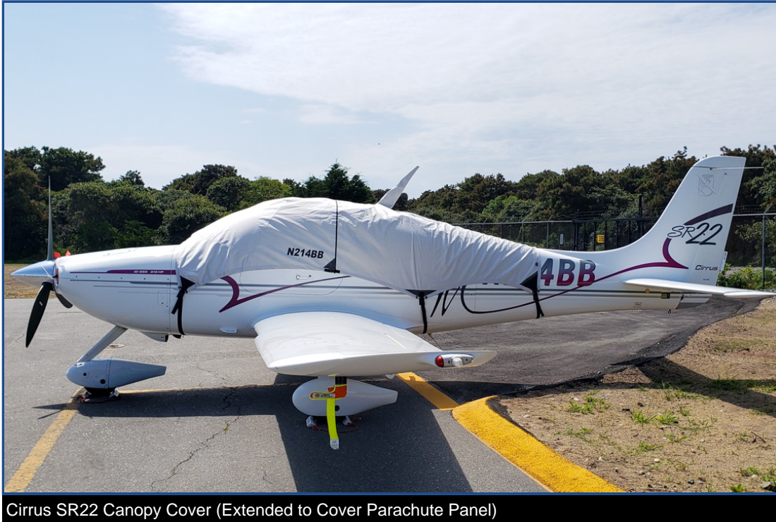
Cirrus SR22 Canopy Cover (Extended to Cover Parachute Panel)