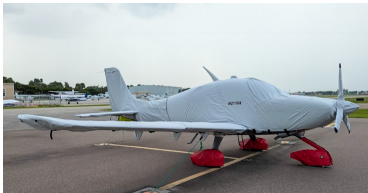
Cirrus SR-20 Complete Cover Set