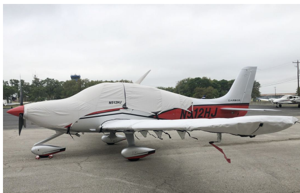
Cirrus SR-22 Canopy/Engine & Wing Covers

WINTER USE MATERIAL - Made with Solution-Dyed Polyester fabric, this option is intended for seasonal use to aid in deicing, rain mitigation, or for occasional travel. The material is lighter and more compact, but more susceptible to UV damage and may have a shorter useful life if used continuously outside than the all-year use material.