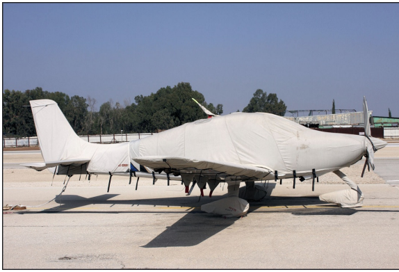
Cirrus SR-22 Full Cover Set