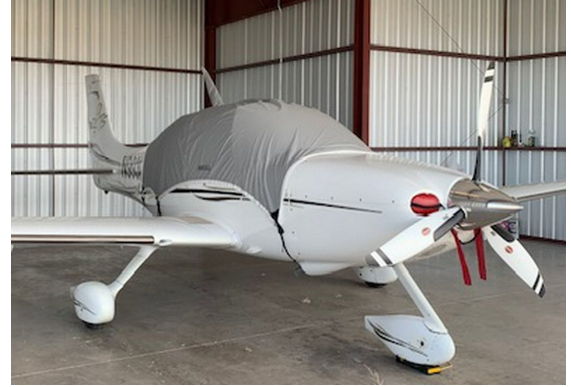
Cirrus SR-22 Travel Weight Canopy Cover