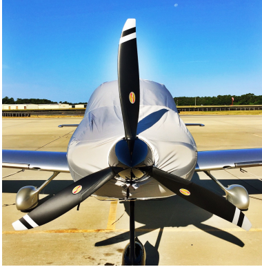
Cirrus SR22 Light Weight Travel Canopy/Engine Cover

Travel Covers are made with Silver Solution-Dyed Polyester fabric and only lined over the windshield to save weight. The material is lightweight and more compact for easy stowage in the aircraft. The polyester material is water resistant, but only intended for occasional use outside. We also have an ultra lightweight material available for fitted hangar dust covers. For daily outdoor use, the non-travel Sunbrella Cover is the best choice.