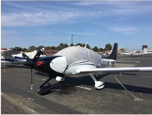
Cirrus SR-20/22 Travel Cover, Light Travel Canopy Cover

non-travel Sunbrella Cover is the best choice.