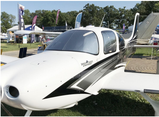
Cirrus SR-22 Cockpit HeatShields

Windshield Heatshields are interior sunshades for an aircraft's front windshield. The product is a unique composite of closed-cell foam with a silver mylar finish. The semi-rigid design is stiff enough to stand along the inside of the windshield using sun visors or window framing. It folds up flat and easily stores in the included storage sleeve. Some designs may require velcro and suction cups or split right and left sides. A Heatshield is an excellent short-term remedy for cockpit overheating. An external fabric cover is far more effective and practical for long-term protection.