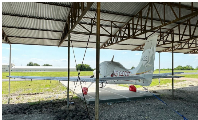
Cirrus SR-22 Canopy, Wing & Wheelpant Covers