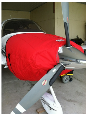
Cirrus SR22 Insulated Engine Cover

This cover type is made from Silver Acrylic Sunbrella canvas and is 100% lined with a soft and smooth microfiber. Bruce's Custom Covers developed this material combination especially for aircraft protection. The outer material is medium weight and treated for water resistance, UV resistance and anti-static buildup. The inner lining is a very soft and smooth microfiber to prevent scratching. The material is very reflective, and tests show that the cabin interior temperature can be reduced to near-ambient temperature on the hottest of days. It is water, ice and snow repellent, yet breathable to allow moisture to escape from between the cover and the aircraft surface.