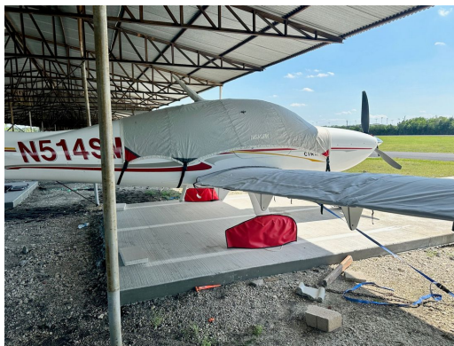
Cirrus SR-22 Canopy, Wing & Wheelpant Covers

the horizontal stabilizers with adjustable straps. Tailcone Covers are normally made with Solution-Dyed Polyester or Acrylic Sunbrella .