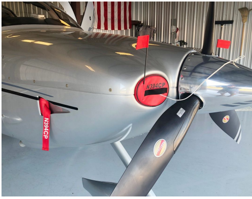
Cirrus SR-22 Engine Plugs