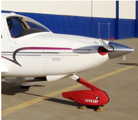
Cirrus SR20 Front Wheelpant/Strut Cover, Engine Plugs

Engine Inlet Plugs are custom fit for your Cirrus SR22 intakes, made with heavy-duty vinyl material, and stuffed with a single block of sculpted urethane foam. Each plug has a zipper that allows the foam to be removed and dried if necessary. Engine plugs have warning flags that are visible from the cockpit or 'remove before flight' streamers sewn onto the face of the plugs. Most plugs are imprinted with the aircraft registration number in black for an extra charge. Storage bag NOT included. Engine plugs may be inserted after flight when the engine is still warm. Engine Inlet Plugs are commonly referred to as Cowl Plugs, Intake Plugs, Cowl Blocks, Engine Blocks, and Engine Bunges.