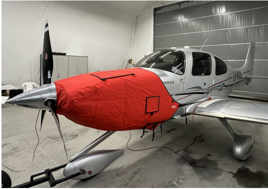
Cirrus SR-22 Insulated Engine Cover