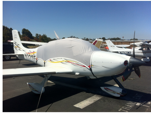
Cirrus SR-22 Light Weight Travel Cover