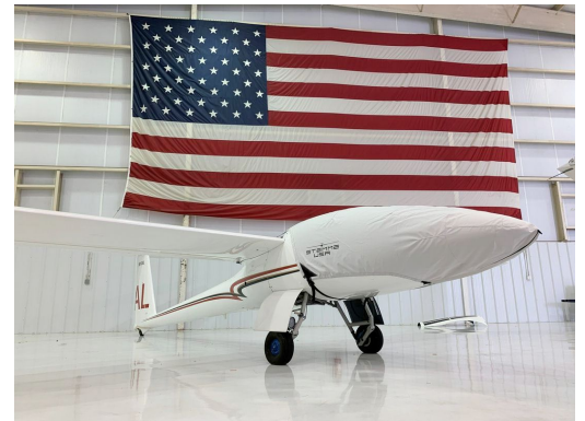
Stemme S-12 Canopy/Nose Cover