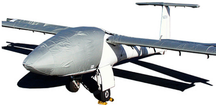
Stemme S-10 Wing Covers & Horiz. Stab. Covers