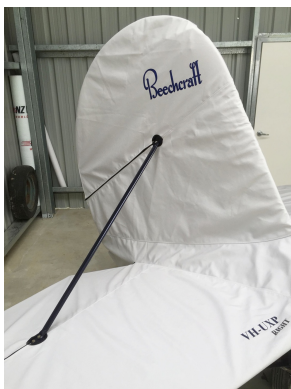
Beech Staggerwing Complete Cover Set, Tail Detail

WINTER USE MATERIAL - Made with Solution-Dyed Polyester fabric, this option is intended for seasonal use to aid in deicing, rain mitigation, or for occasional travel. The material is lighter and more compact, but more susceptible to UV damage and may have a shorter useful life if used continuously outside than the all-year use material.