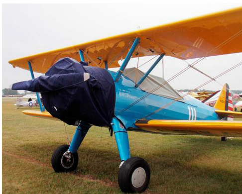
Stearman PT-13 Engine Cover

This cover type is made from Silver Acrylic Sunbrella canvas and is 100% lined with a soft and smooth microfiber. Bruce's Custom Covers developed this material combination especially for aircraft protection. The outer material is medium weight and treated for water resistance, UV resistance and anti-static buildup. The inner lining is a very soft and smooth microfiber to prevent scratching. The material is very reflective, and tests show that the cabin interior temperature can be reduced to near-ambient temperature on the hottest of days. It is water, ice and snow repellent, yet breathable to allow moisture to escape from between the cover and the aircraft surface.