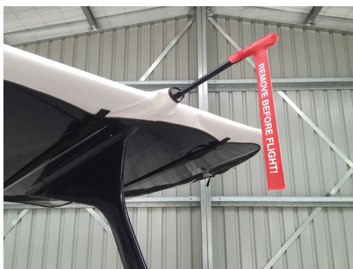
Beech Staggerwing Complete Cover Set, Upper Wing Detail

WINTER USE MATERIAL - Made with Solution-Dyed Polyester fabric, this option is intended for seasonal use to aid in deicing, rain mitigation, or for occasional travel. The material is lighter and more compact, but more susceptible to UV damage and may have a shorter useful life if used continuously outside than the all-year use material.