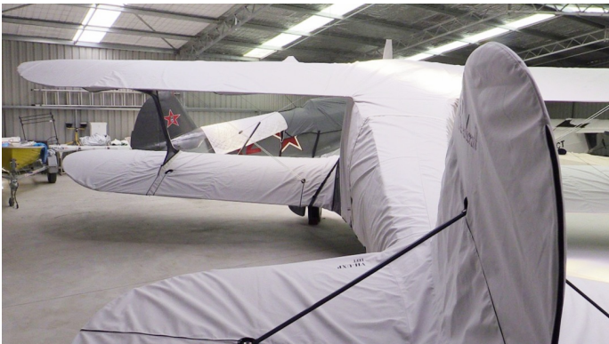
Beech Staggerwing Complete Cover Set