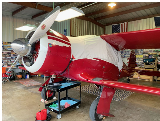
Beech Staggerwing D17S Canopy Cover