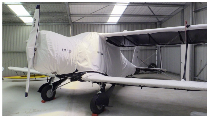
Beech Staggerwing Complete Cover Set