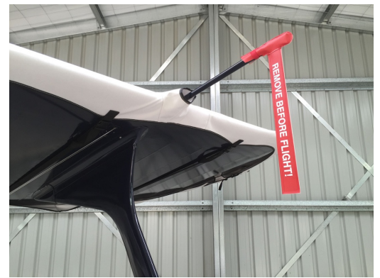
Beech Staggerwing Complete Cover Set, Upper Wing Detail