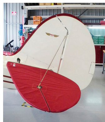
Waco UPF-7 Horizontal Stab. Cover