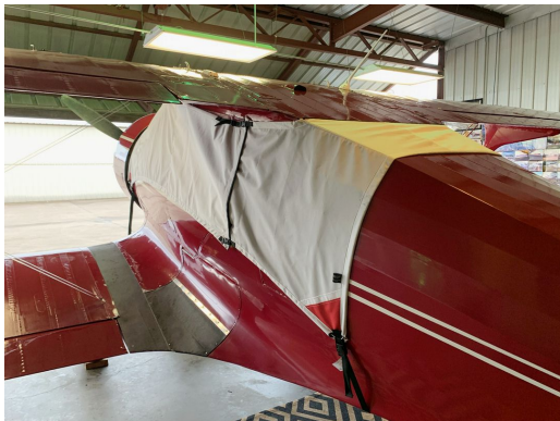
Beech Staggerwing D17S Canopy Cover

This cover type is made from Silver Acrylic Sunbrella canvas and is 100% lined with a soft and smooth microfiber. Bruce's Custom Covers developed this material combination especially for aircraft protection. The outer material is medium weight and treated for water resistance, UV resistance and anti-static buildup. The inner lining is a very soft and smooth microfiber to prevent scratching. The material is very reflective, and tests show that the cabin interior temperature can be reduced to near-ambient temperature on the hottest of days. It is water, ice and snow repellent, yet breathable to allow moisture to escape from between the cover and the aircraft surface.