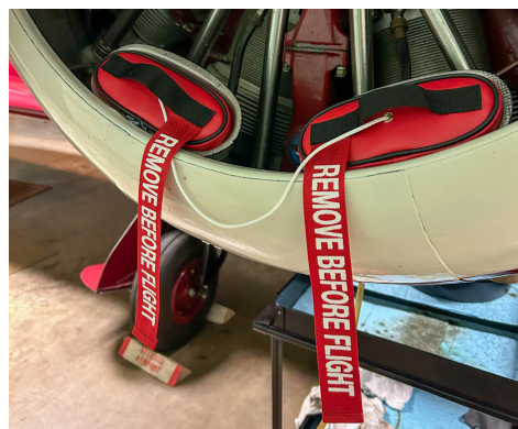
Beech Staggerwing Carb Inlet Plugs, Located Inside Engine