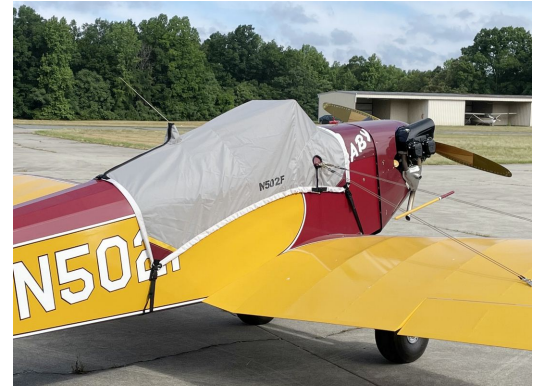
Bowers Fly Baby Canopy Cover