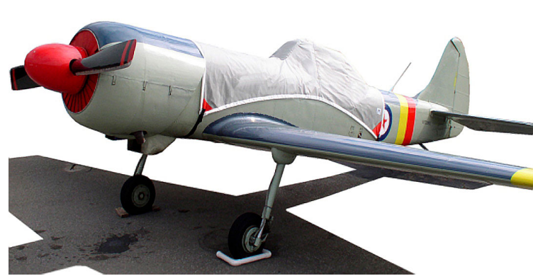
Yak 50 Canopy Cover

Covers developed this material combination especially for aircraft protection. The outer material is medium weight and treated for water resistance, UV resistance and anti-static buildup. The inner lining is a very soft and smooth microfiber to prevent scratching. The material is very reflective, and tests show that the cabin interior temperature can be reduced to near-ambient temperature on the hottest of days. It is water, ice and snow repellent, yet breathable to allow moisture to escape from between the cover and the aircraft surface.