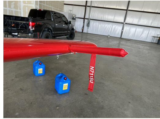
Sukhoi SU-26 Pitot Cover