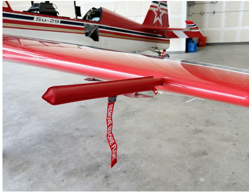
Sukhoi SU-26 Pitot Cover

Sukhoi SU-26 Pitot Tube Covers , NOT HEAT RESISTANT TYPE, are made of Naugahyde vinyl, and are designed to cover the entire pitot assembly. Slipping over the tube, the cover tightens around the base with a Velcro strap detail. A "Remove Before Flight" streamer is attached to the cover. Heat Resistant Pitot Covers are an upgrade to this design, and help prevent the pitot cover from melting onto the tube if the pitot heat is accidentally turned on while installed. If you want the set tethered together, please let us know.