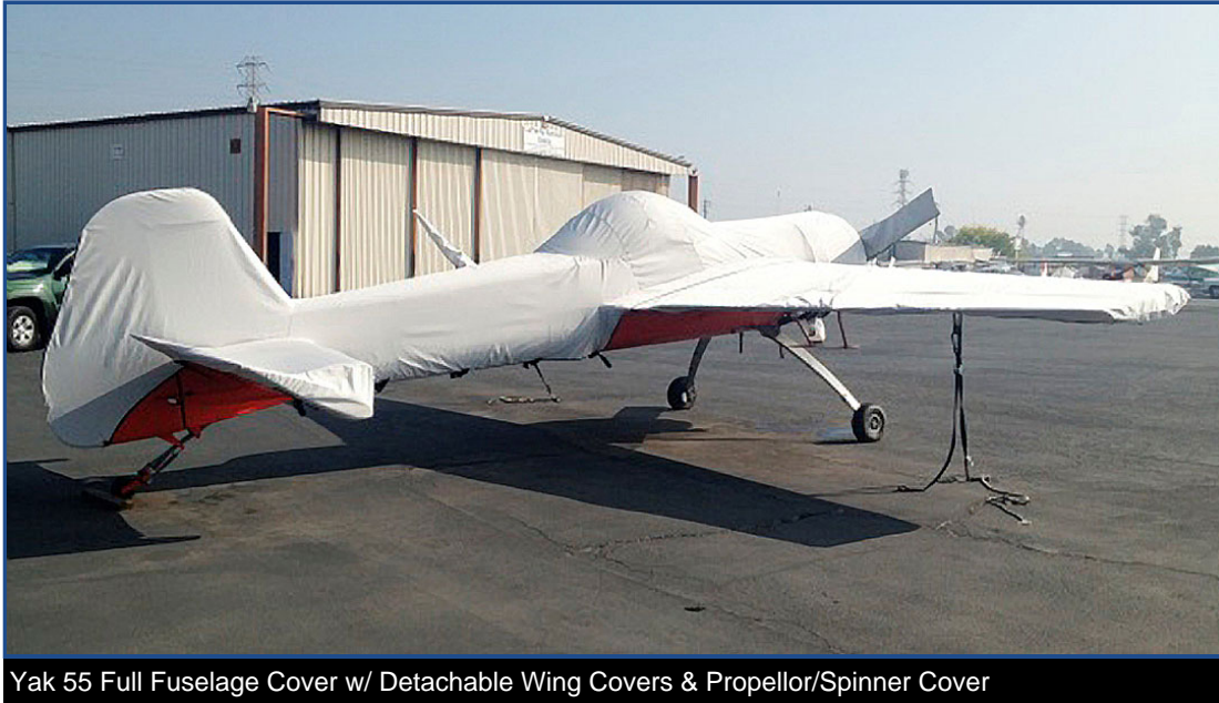
Yak 55 Full Fuselage Cover w/ Detachable Wing Covers &amp; Propellor/Spinner Cover