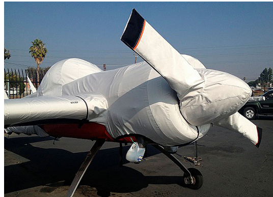
Sukhoi SU-26 Extended Canopy/Engine Cover