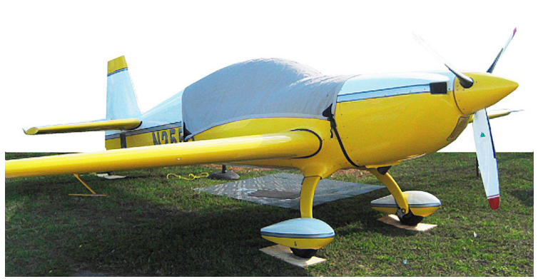
Extra 300/L Canopy Cover