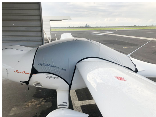
SUNDANCER Travel Cover with custom Imprint