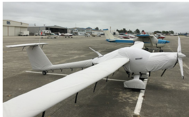
Lambda Canopy/Engine Cover and Wing Covers Distar Sundancer LSA Extended Canopy/Engine, Prop, Wheelpants, Wings & Empennage Covers