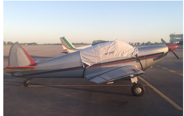
Globe Swift Canopy Cover