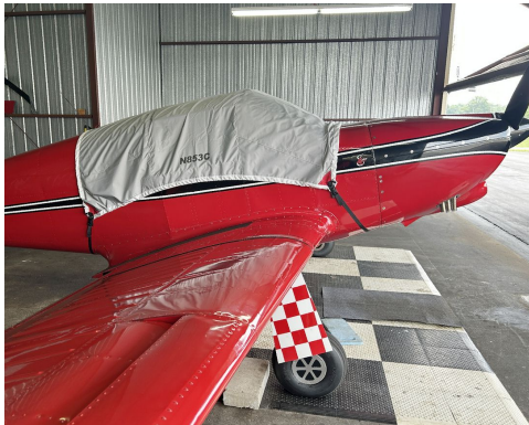
Swift Travel Cover, Light Weight Canopy Cover (Standard Canopy)

Travel Covers are made with Silver Solution-Dyed Polyester fabric and only lined over the windshield to save weight. The material is lightweight and more compact for easy stowage in the aircraft. The polyester material is water resistant, but only intended for occasional use outside. We also have an ultra lightweight material available for fitted hangar dust covers. For daily outdoor use, the non-travel Sunbrella Cover is the best choice.