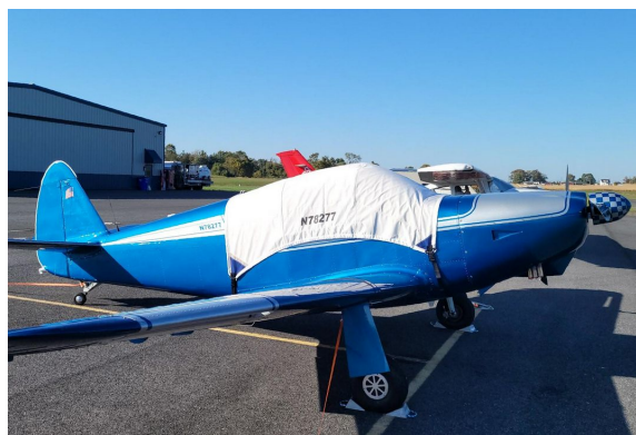
Swift GC-1B Canopy Cover