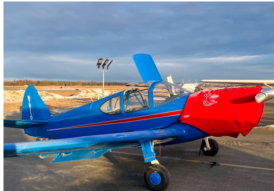
Globe Swift Insulated Engine Cover

This cover type is made from Silver Acrylic Sunbrella canvas and is 100% lined with a soft and smooth microfiber. Bruce's Custom Covers developed this material combination especially for aircraft protection. The outer material is medium weight and treated for water resistance, UV resistance and anti-static buildup. The inner lining is a very soft and smooth microfiber to prevent scratching. The material is very reflective, and tests show that the cabin interior temperature can be reduced to near-ambient temperature on the hottest of days. It is water, ice and snow repellent, yet breathable to allow moisture to escape from between the cover and the aircraft surface.