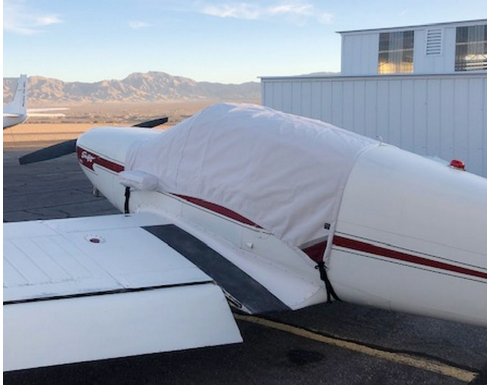
Globe-Temco Swift Canopy Cover, standard type

This cover type is made from Silver Acrylic Sunbrella canvas and is 100% lined with a soft and smooth microfiber. Bruce's Custom Covers developed this material combination especially for aircraft protection. The outer material is medium weight and treated for water resistance, UV resistance and anti-static buildup. The inner lining is a very soft and smooth microfiber to prevent scratching. The material is very reflective, and tests show that the cabin interior temperature can be reduced to near-ambient temperature on the hottest of days. It is water, ice and snow repellent, yet breathable to allow moisture to escape from between the cover and the aircraft surface.