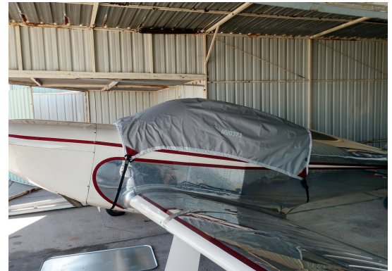
Globe GC-1B Lightweight Travel Cover