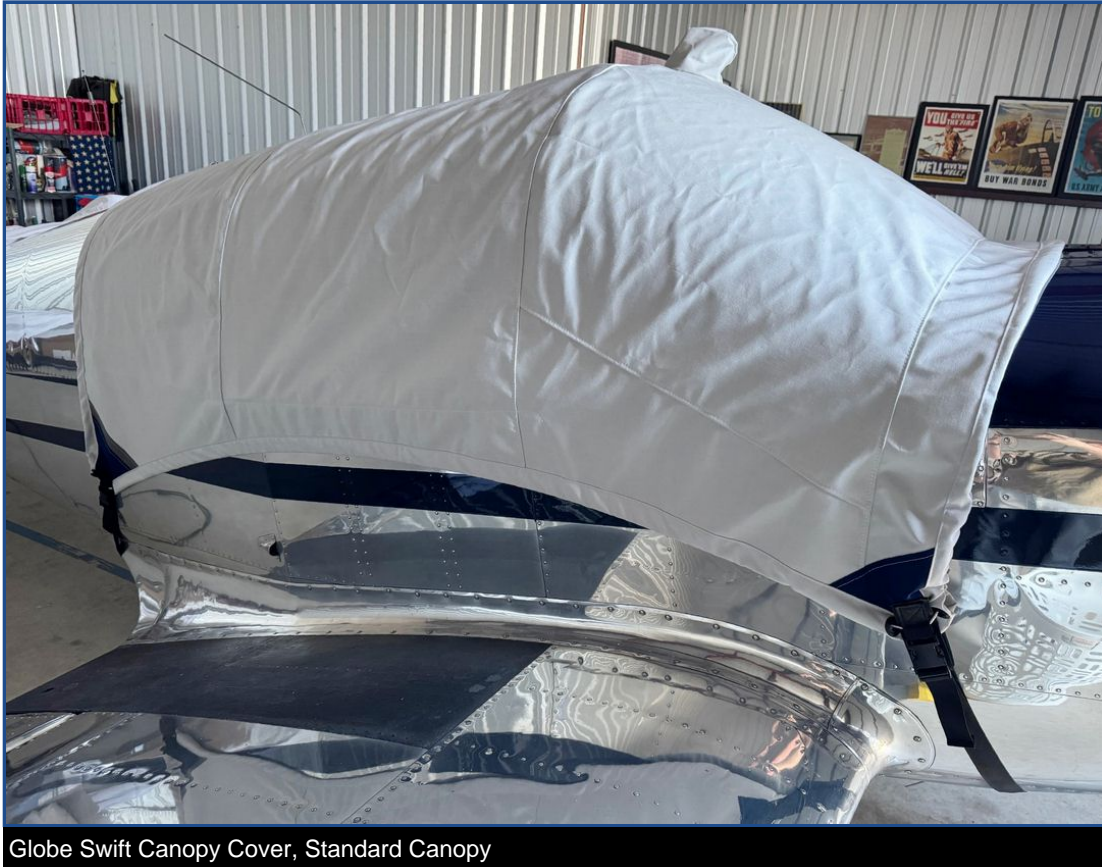
Globe Swift Canopy Cover, Standard Canopy