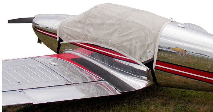
Swift Canopy Cover

This cover type is made from Silver Acrylic Sunbrella canvas and is 100% lined with a soft and smooth microfiber. Bruce's Custom Covers developed this material combination especially for aircraft protection. The outer material is medium weight and treated for water resistance, UV resistance and anti-static buildup. The inner lining is a very soft and smooth microfiber to prevent scratching. The material is very reflective, and tests show that the cabin interior temperature can be reduced to near-ambient temperature on the hottest of days. It is water, ice and snow repellent, yet breathable to allow moisture to escape from between the cover and the aircraft surface.