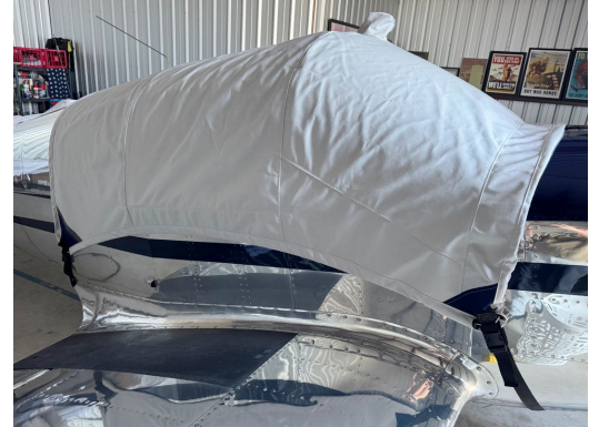
Globe Swift Canopy Cover, Standard Canopy