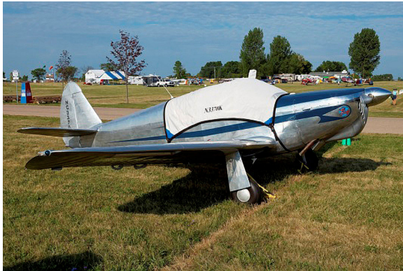
Globe Swift Canopy Cover

This cover type is made from Silver Acrylic Sunbrella canvas and is 100% lined with a soft and smooth microfiber. Bruce's Custom Covers developed this material combination especially for aircraft protection. The outer material is medium weight and treated for water resistance, UV resistance and anti-static buildup. The inner lining is a very soft and smooth microfiber to prevent scratching. The material is very reflective, and tests show that the cabin interior temperature can be reduced to near-ambient temperature on the hottest of days. It is water, ice and snow repellent, yet breathable to allow moisture to escape from between the cover and the aircraft surface.