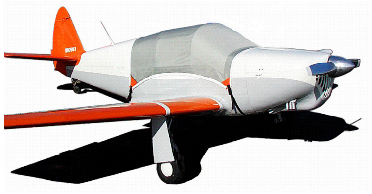
Standard Canopy Cover for Swift