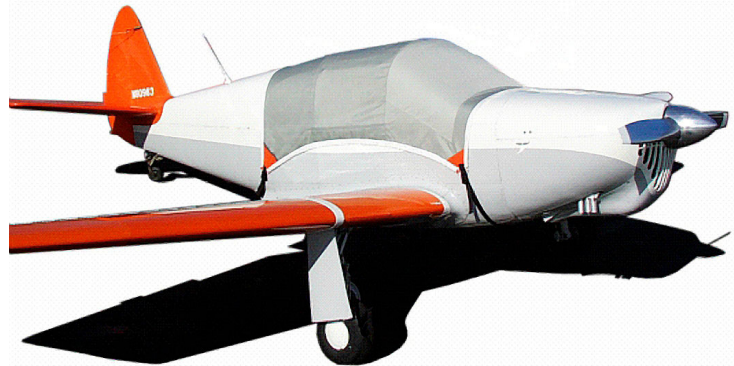
Standard Canopy Cover for Swift